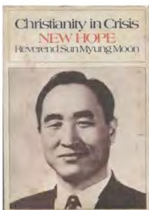
The front cover of "Christianity in Crisis: New Hope" published in 1974 by HSA-UWC (Unification Church).

Philadelphia, Boston, Washington DC, New Orleans, Dallas, Tampa, Atlanta, Omaha, Minneapolis, Cincinnati, Detroit, Chicago, Kansas City, Tulsa, Denver, Seattle, San Francisco, Berkeley, and Los Angeles.