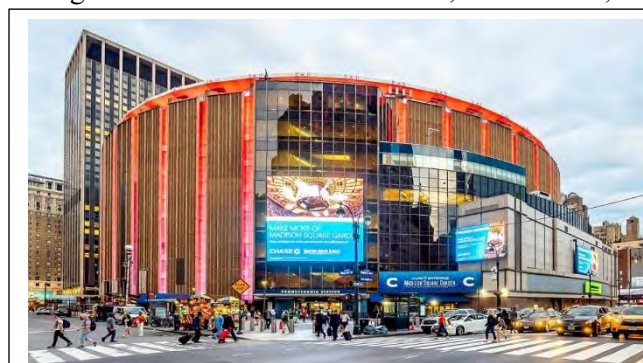
Madison Square Garden, NYC

"It all worked for the Rev. Sun Myung Moon , 54, [...] who packed Madison Square Garden to overflowing last week. The happening, complete with numbers by the Korean Folk Ballet, kicked off an eight-city tour that climaxes his drive to build a base in the U.S. just seven years before the Messianic Age is to begin. Moon , through an interpreter, told the Garden-goers in guttural shouts, 'The time of the Second Coming of Christ is near, and America is the landing site!'" (From "Religion 1974: Moon in Manhattan", Time Oct. 5, 1983)