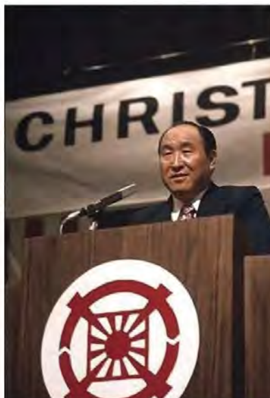
Father Moon during 21-city speaking tour 1973/74.

He spoke three evenings in each city and held these speeches: "God's Hope for Man", "God's Hope for America" and "The Future of Christianity". The 21 cities were New York, Baltimore, Philadelphia, Boston