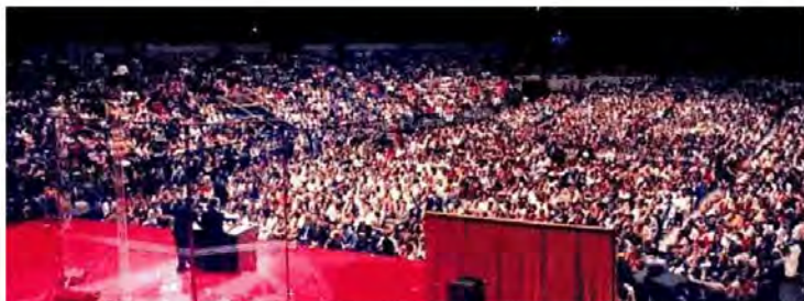
Father Moon speaking in Madison Square Garden, New York 18 th Sep. 1974.