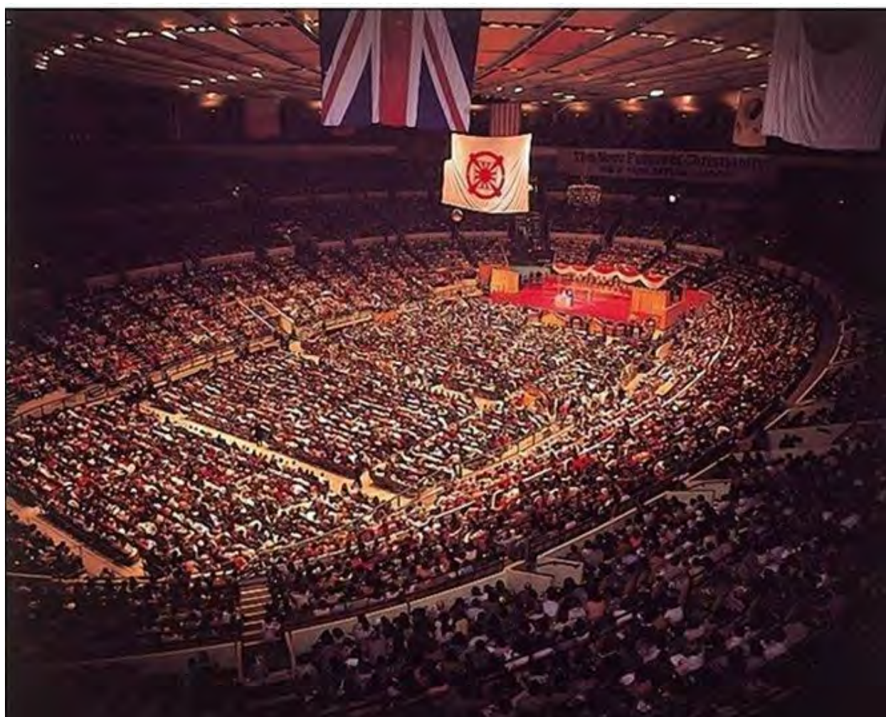
From the rally at Madison Square Garden, New York on 18th September 1974

50 years since large historical rally at Madison Square Garden, New York, where Father Moon proclaimed "The New Future of Christianity"