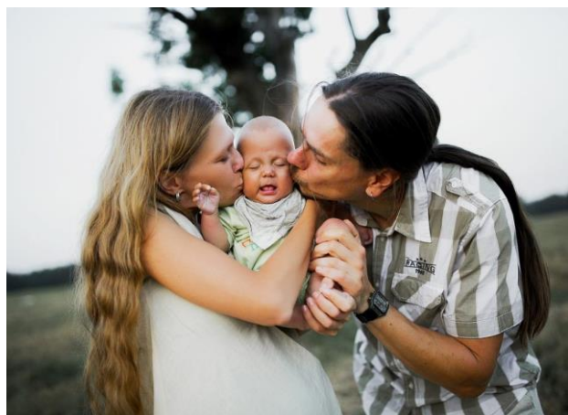
Parents kissing baby in Belarus August 2017

Presenter: The concept of God is present in so many religions these days. How would you put the way that people see it in the Family Federation (formerly the Unification Church )?