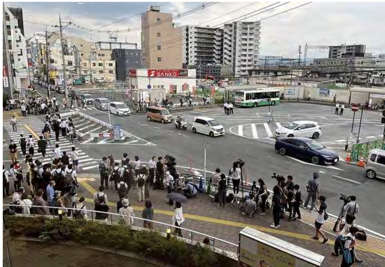
The immediate aftermath of the assassination of former Japanese Prime Minister Shinzo Abe, in the vicinity of Kintetsu Yamato-Saidaiji station northern entrance on 8th July 2022

See 1st article , 2nd article , 3rd article , 4th article , 5th article , 6th article , 7th article , 8th article , 9th article , 10th article , 11th article , 12th article , 13th article , 14th article , 15th article , 16th article , 17th article , 18th article , 19th article , 20th article , 21st article , 22nd article , 23rd article , 24th article , 25th article , 26th article