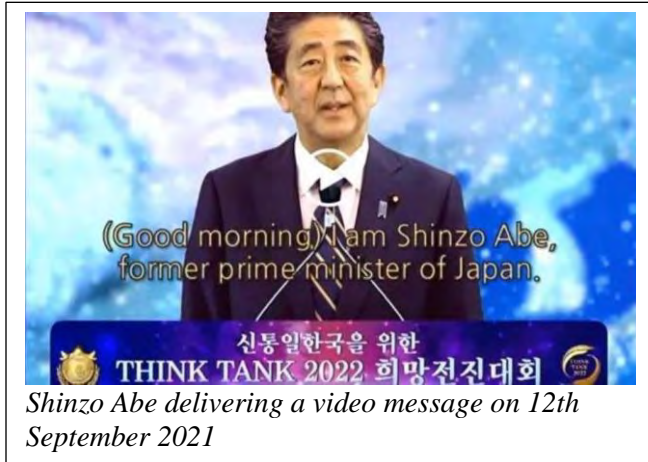
Shinzo Abe delivering a video message on 12th September 2021

Regarding the question why former Prime Minister Abe was targeted, the drama portrayed a scene where the main character watches on his computer a video message from Abe. This message was sent to an event held by the Universal Peace Federation, a group related to the religious organization . The drama also suggested that the crime was committed because the suspect believed Abe's grandfather, former Prime Minister Nobusuke Kishi (岸信介), had invited the religious organization to Japan, and that Abe himself was also connected to it.