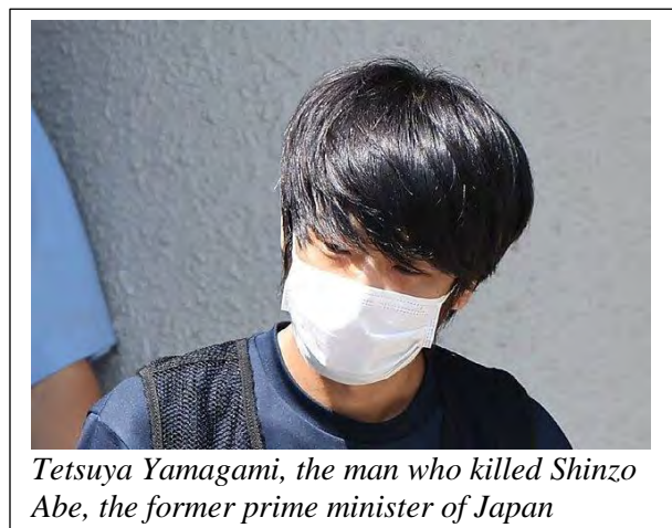
Tetsuya Yamagami, the man who killed Shinzo Abe, the former prime minister of Japan

"When did the man begin preparing for the attack? Why was former Prime Minister Abe targeted? We will recreate the events based on the police report, statements that have come to light, and interviews with those involved."