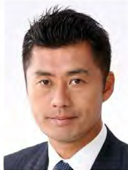
Goshi Hosono.

“The media has begun a race to report on the man who attacked Prime Minister Kishida and his motives for the terror. I see no value in this reporting other than that they ‘sell’. ”