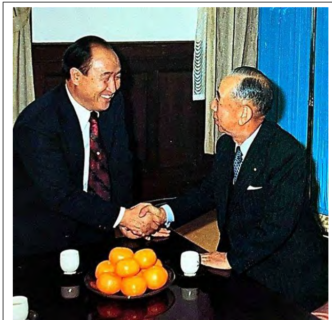
Sun Myung Moon and Nobusuke Kishi, Prime Minister of Japan 1957-1960, shaking hands in Tokyo

The program also showed a photo of Unification Church founder Sun Myung Moon meeting with Kishi and touched on the "ties" between the Liberal Democratic Party (LDP) and the religious organization . As criticism of the religious organization and the LDP grew, the government requested a court order to dissolve the organization .