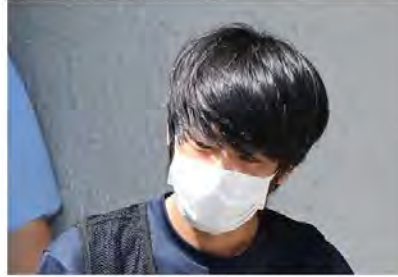
Tetsuya Yamagami, the man who killed Shinzo Abe, the former prime minister of Japan.