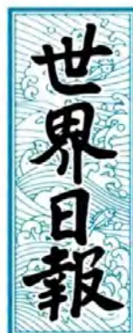
Logo of the Sekai Nippo

Sympathy for terrorists created by media's generous coverage of motive and background of assassins and would-be assassins