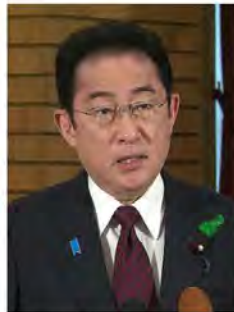
Prime Minister Fumio Kishida on 16th April 2023, the day after a bomb was thrown at him. Photo: 首相官邸ホームページ / Wikimedia Commons. License: CC Attr 4.0 Int

On the morning of 15 th April 2023, an incident occurred where something resembling a pipe bomb was thrown at Prime Minister Fumio Kishida, who had come in a hurry to the Saikazaki Fishing Cooperative to support the House of Representatives by-election in Wakayama District 1. The arrested suspect was Ryūji Kimura (木村隆二), who was 24 years old at the time.