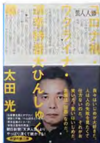
The front page cover of "Geinin Ningyo: Corona Pandemic, Ukraine, and Election Special - The Great Displeasure Edition" by Hikari Ota, published on Asahi Shimbun Publishing.

However, even though the full picture of the assassination of former Prime Minister Shinzo Abe (安倍晋三) remains unclear, the media jumped on the leaked information from the investigative authorities that there was a grudge against a religious organization. The media heated up the reporting based on the premise that this was the motive for the crime.