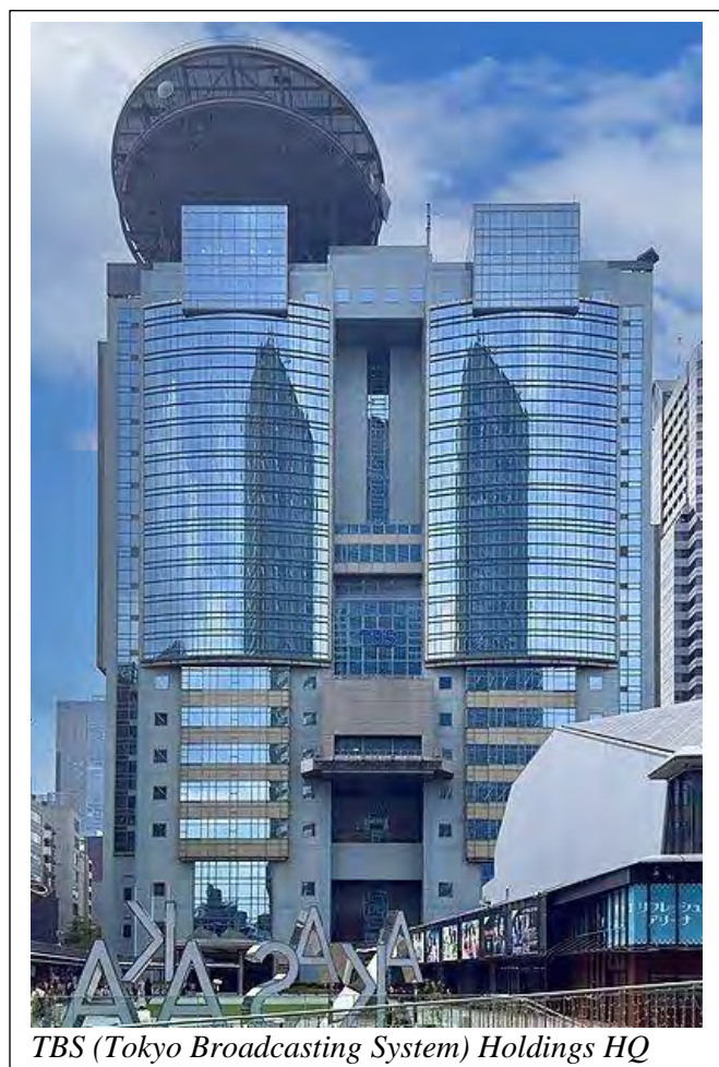
TBS (Tokyo Broadcasting System) Holdings HQ