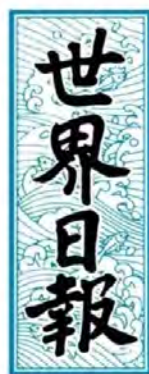
Logo of the Sekai Nippo

Members of religious minority denied contracts because of their faith