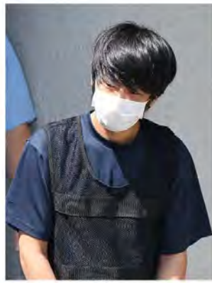
Committed heinous crime: Tetsuya Yamagami, the man who killed Shinzo Abe, the former prime minister of Japan.

The news coverage surrounding the assassination of former Prime Minister Shinzo Abe became a major sensation when police information emerged shortly after the incident. This information stated that Tetsuya Yamagami (山上徹也), the accused, harbored resentment toward the high monetary donations made by his mother, a member of the Family Federation for World Peace and Unification (formerly known as the Unification Church ). The criticism of the Family Federation became so intense and frequent that it overshadowed the heinous nature of the crime itself.