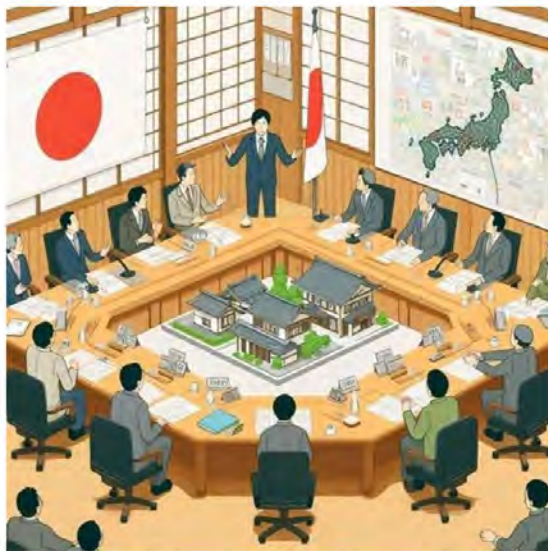
Debate in a Japanese city council meeting. Illustration: Microsoft Designer Image Creator 18th July 2024.

"If you look at the principle of criminal legality in Article 31 of the Constitution, the Japanese authorities are to punish those who have committed a crime. It is against the Constitution to try to exclude those who have not committed a specific crime."