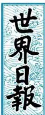
Logo of the Sekai Nippo

Japanese politician warns that any religious organization could become target of current persecution of minority faith.