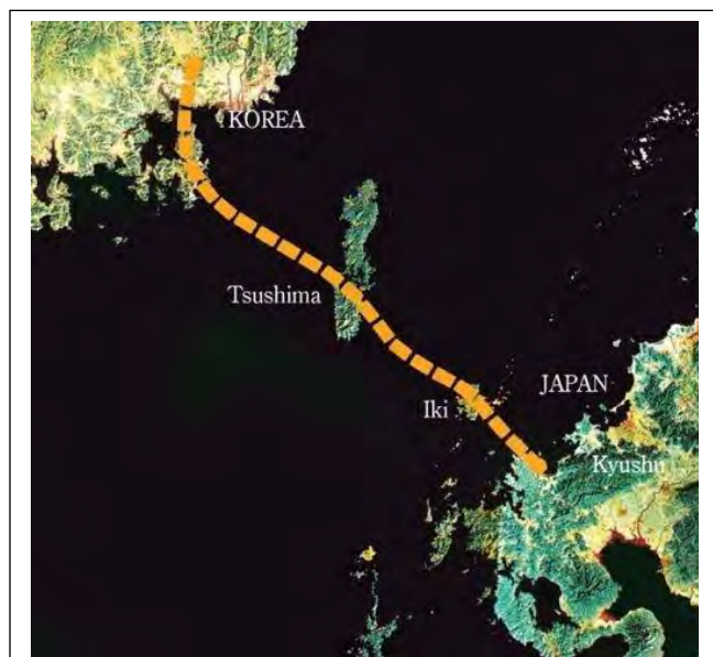
A proposed tunnel project between the Japanese island of Kyushu and South Korea.