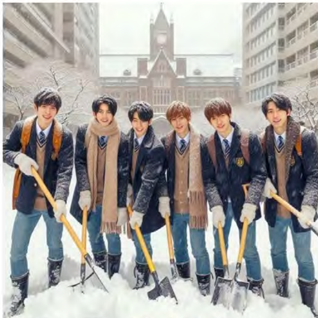
Student volunteers from the Family Federation ready to clear snow. Illustration by Microsoft Designer Image Creator 18th July 2024.

of citizens based on their affiliation with the Family Federation at any public service counters. The authorities responded that "such a thing is impossible."