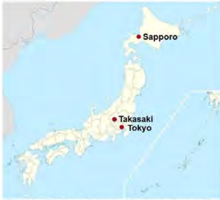
Location of the cities mentioned.

Religion”, following the first one in March of this year, was held, attracting about 400 believers.