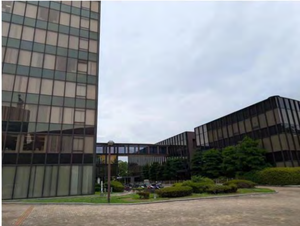
Kitakyushu City Hall (left) and City Council