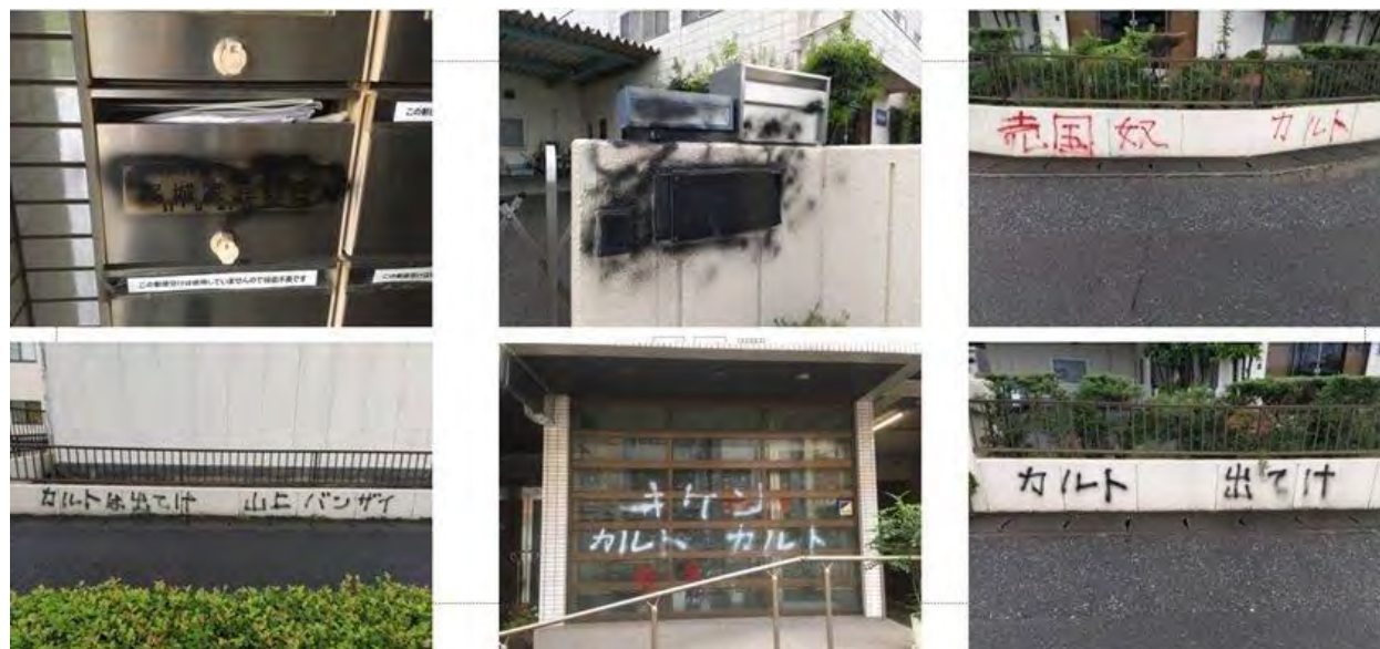
Widespread discrimination by authorities made situation much worse: Hate Graffiti sprayed on Family Federation properties throughout Japan

In fact, applications (requests) were no longer accepted, and several members of the Universal Peace Federation (UPF), a related organization, filed lawsuits against Toyama City, Osaka Prefecture, Osaka City, and Tondabayashi City seeking the cancellation of the resolutions. Additionally, the Family Federation filed a lawsuit against Kitakyushu City.