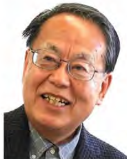
Norio Hosoya (細谷典男), Japanese author and politician. Among his books is one titled “ The Constitution and the Former Unification Church ” (憲法と『旧統一教会』) (2023).

“The government’s approach of filing a request for a dissolution order based solely on one-sided claims cannot be considered democratic and has extremely strong totalitarian overtones.”