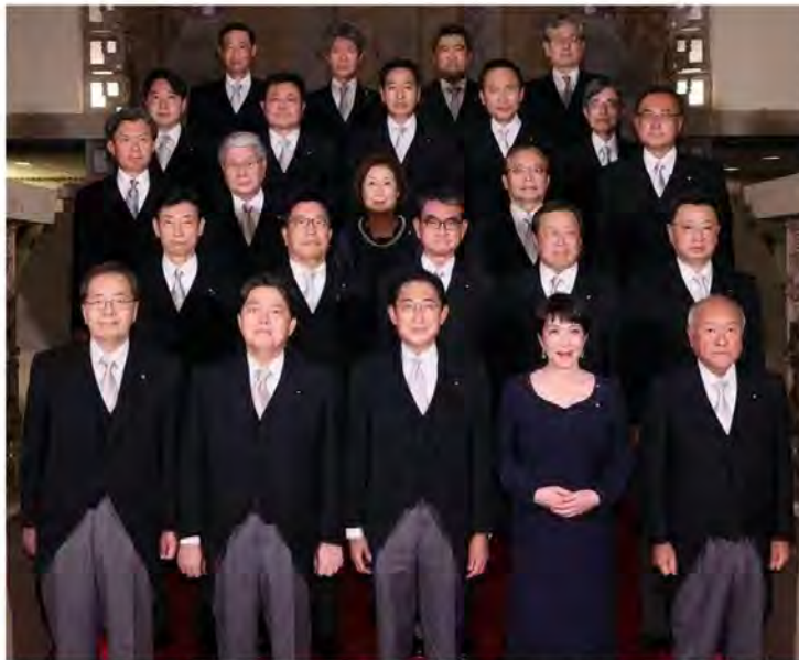
Photo taken 10th August 2022 at the Prime Minister's official residence in conjunction with the inauguration of the second Kishida reshuffled cabinet. Photo: 内閣官庁内閣広報室 / Wikimedia Commons. License: CC BY 4.0 Int. Cropped