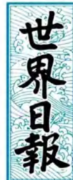
Logo of the Sekai Nippo

by the Freedom of Religion Reporting Team of the editorial department of Sekai Nippo