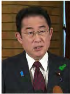
Prime Minister Fumio Kishida violating religious freedom. Here, 16th April 2023.

"As far as I know, I personally have no connection with the said organization. [...] To dispel public doubts, during this Cabinet reshuffle, I instructed ministers to inspect their relationships with the organization in question, take responsibility as politicians, and to make strict revisions based on the results. Only those who understood and agreed to this were appointed."