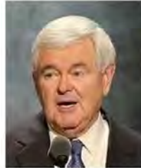
Met with Fumio Kishida in 2019: Newt Gingrich, here speaking at the Republican National Convention 20th July 2016.

In October 2019, when Prime Minister Kishida was the Chairman of the Policy Research Council of the Liberal Democratic Party , he held a meeting at the party headquarters with Newt Gingrich, former Speaker of the United States House of Representatives . During this meeting, he also met and exchanged business cards with leaders of the Universal Peace Federation (UPF) of Japan, an organization with ties to the Family Federation . When questioned about this, the Prime Minister responded by acting as if he had forgotten about it entirely, saying, "I am not aware of it."