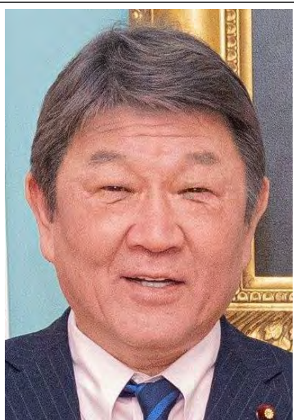
Toshimitsu Motegi in May 2023

infected with the new coronavirus, held a press conference at the Prime Minister's Office and declared, in his capacity as President of the Liberal Democratic Party, a severance of ties with the Family Federation .