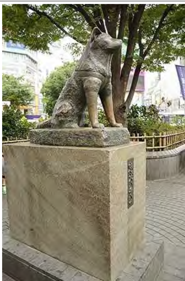
Hachiko, the Loyal Dog at Shibuya station, Tokyo

Previously, at gatherings in Nagasaki and other places, I have mentioned that demonstrations are a citizen's right. Given the current situation with the Family Federation, I believe we should raise our voices in a noticeable way.