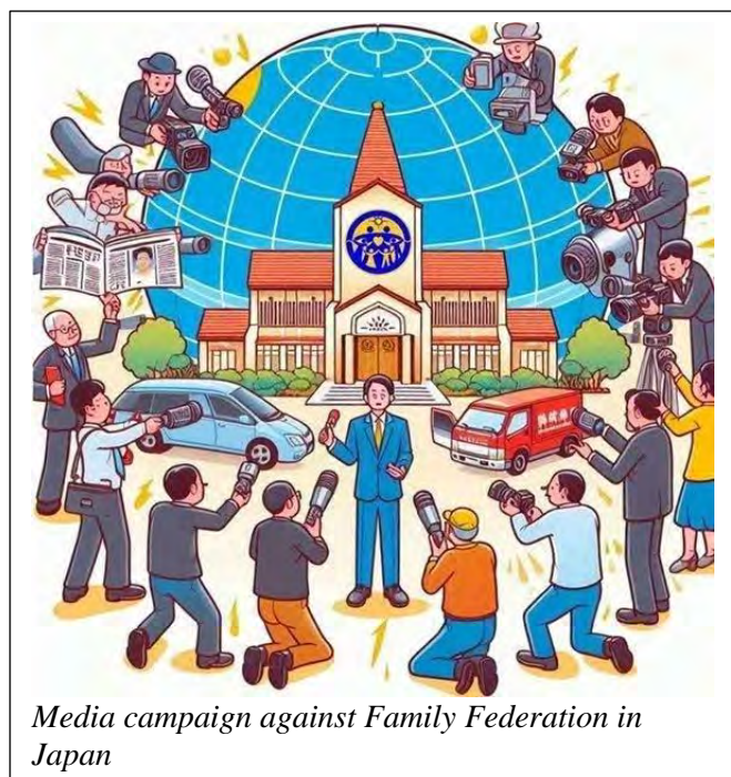
Media campaign against Family Federation in Japan

That is because the media, probably many media outlets and television, and the National Network of Lawyers Against Spiritual Sales are aiming in the same direction. They are anti-religious. The general public in Japan also has no understanding of religion. That was true for me personally as well. The media amplifies this anti-religious sentiment, especially magazines like Bungei Shunju (Bunshun) are completely anti-religious. They are all like that, including the Shukan Shincho.