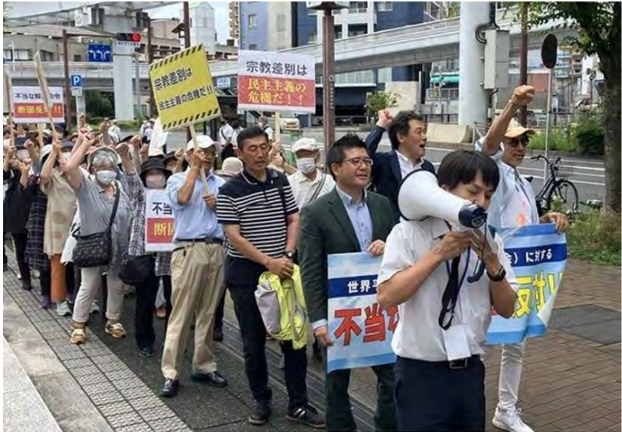
From the demo in Kitakyushu City 30th June 2024

July, followers of the Family Federation for World Peace and Unification (formerly known as the Unification Church ) held rallies and marches across the country, calling for freedom of religion.