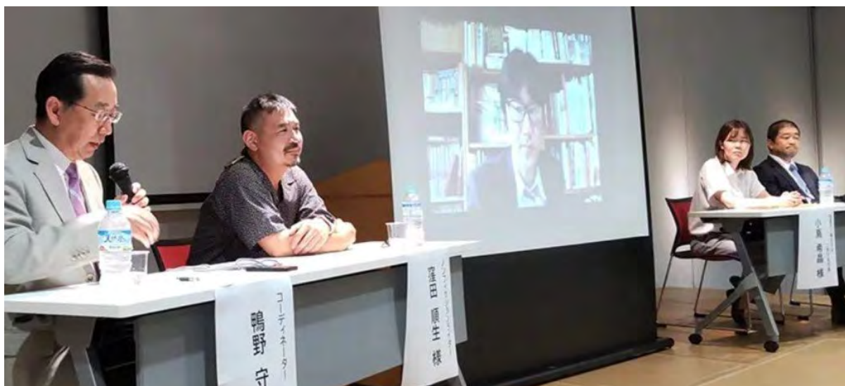
Discussions about faith experiences and social contributions were held at the 'Akita Rally to Protect Freedom of Religion' on 30th June 2024, in Akita City

In Shinjuku Ward, Tokyo, on 30th June, about 100 followers held a protest march, claiming that the declaration by the Liberal Democratic Party to sever ties with the Family Federation was infringing on the followers' human rights. They chanted slogans such as "Protect freedom of religion".