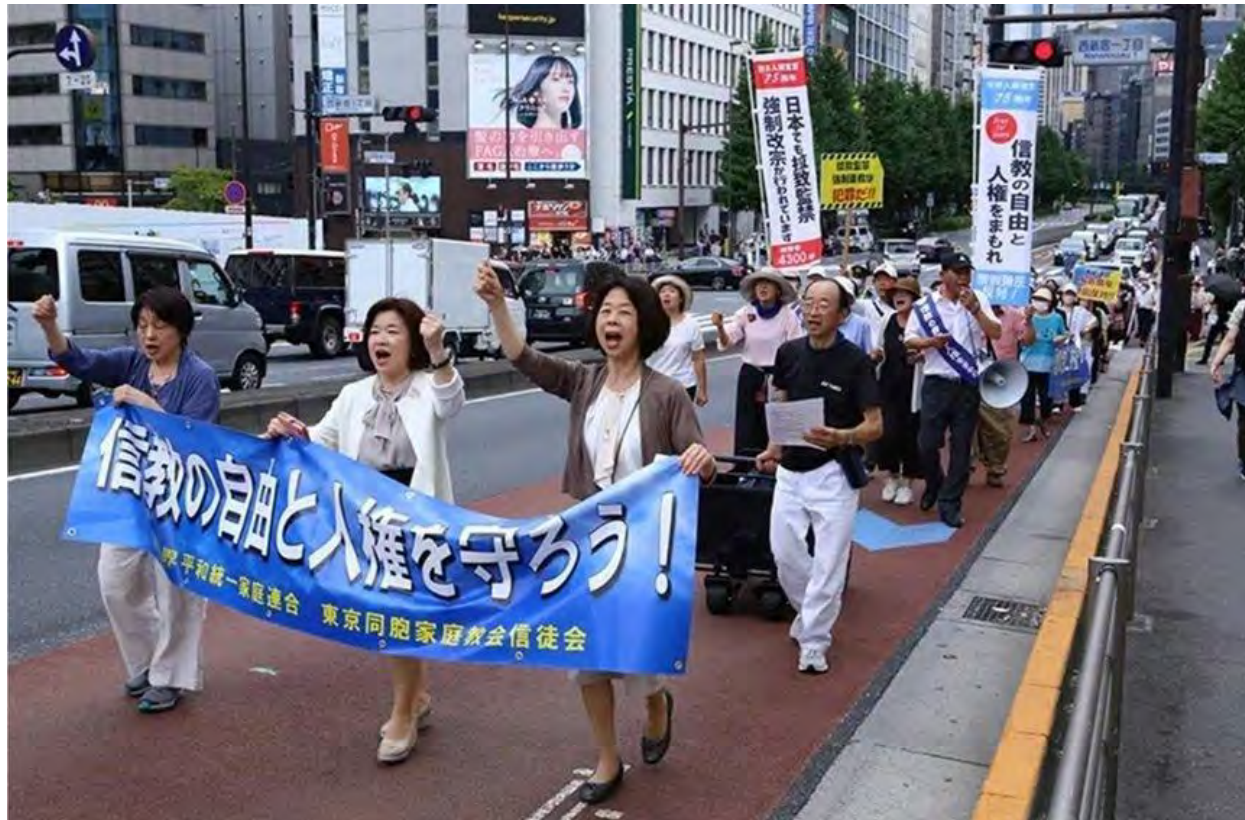
Members of the Family Federation for World Peace and Unification and the Tokyo Fellowship Family Church march in a demonstration shouting, "Protect freedom of religion and human rights" - on 30th June 2024, in Shinjuku, Tokyo