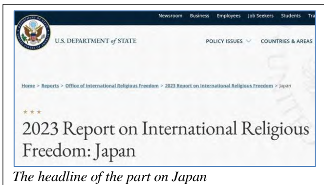
The headline of the part on Japan

The 2023 Report on International Religious Freedom was published 26th June 2024 by the U.S. Department of State. Its yearly report on religious liberty is considered the most comprehensive of its kind published internationally. The 2023 report "documents systematic, ongoing, and egregious violations of religious freedom that have occurred in the last year". It also "provides recommendations to the U.S. government intended to deter religious persecution and promote freedom of religion and belief abroad."