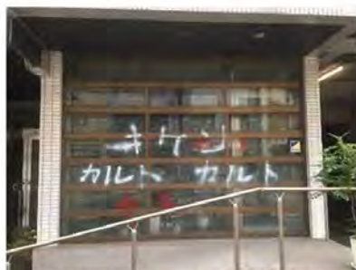
Graffiti sprayed on Family Federation

The huge number of open hostilities against the Family Federation include graffiti sprayed on cars, and windows of church facilities being broken during prayer sessions.