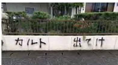
Grffiti sprayed on Family Federation facilities in Japan after the Abe assassination in July 2022.

The Family Federation announced that it will present these details in writing to Tokyo District Court during the hearings for the dissolution order requested by the Kishida administration. The religious organization also reported recurring incidents of graffiti with messages like "Traitor cult" and "Cult, get out," along with nuisance phone calls at churches in various locations across the nation.