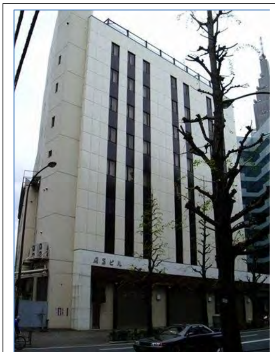
AS building where the Akahata Shimibun's editorial department is located in Tokyo

"In relation to the issue of illegal solicitation of organizational newspapers, including the Japanese Communist Party's newspaper Shimbun Akahata, within government offices on a nationwide scale, our paper has obtained the results of a survey conducted by Samukawa (寒川) town in Kanagawa (神奈川県) prefecture targeting all management staff. According to the survey, 70% of management staff had been solicited to subscribe to party newspapers, and of those, more than half felt pressured to subscribe.