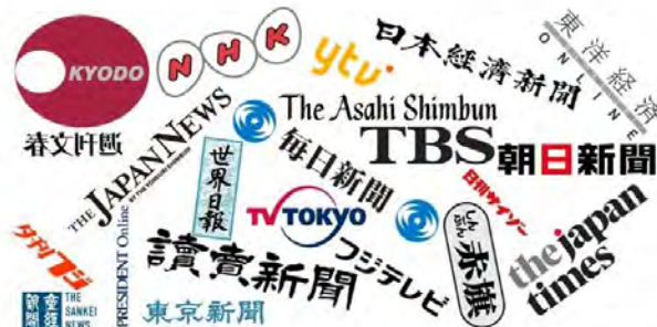
Some Japanese media outlets.

Essentially, doesn't the media have a role to play in curbing the government's recklessness?