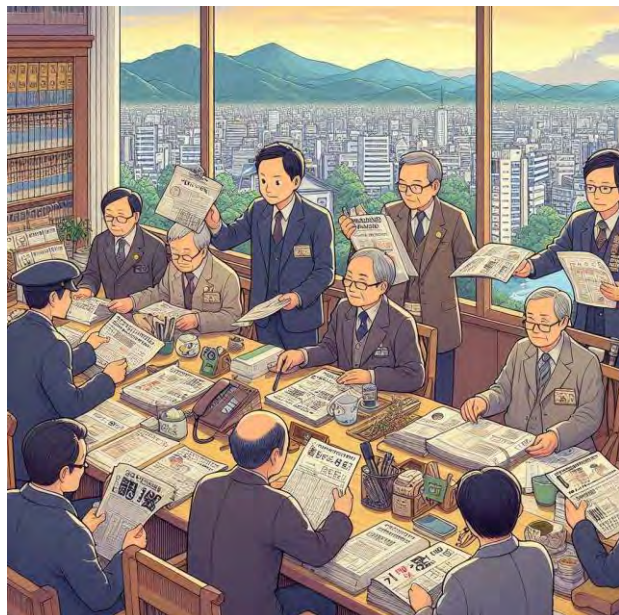
Soliciting for subscriptions in Japanese office building