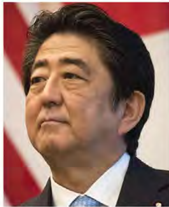
Shinzo Abe in 2017.

It is said that Abe sending a video message to an organization related to the Family Federation (formerly known as the Unification Church) evoked in people a feeling of him having a friendly relationship with the religious organisation. However, even in Brazil, where the constitution mandates the separation of religion and state, it is common and legal for politicians to attend events of religious associations and deliver greetings. Isn't it contrary to the separation of church and state for the state to persecute a particular religion?