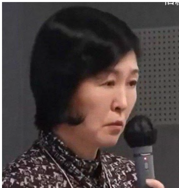
Japanese writer and investigative journalist Masumi Fukuda speaking in Tokyo in January 2024

Seasoned writer and journalist encourages believers to speak out and demonstrate: "Raise your voice!"