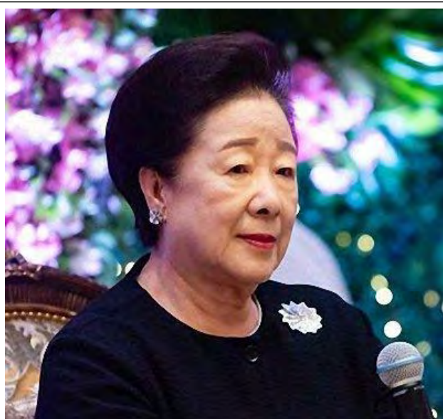
Mother Moon speaking in Las Vegas 8th Oct. 2023

Let me read one more passage. Mother Moon gave these words in Las Vegas on 8th October 2023: