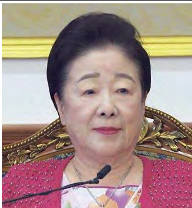
Mother Moon in Gapyeong, South Korea 1st Sep. 2023

hosted by the True Parents of Heaven, Earth and Humankind on 1st September last year.