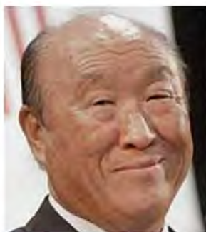
Father Moon.