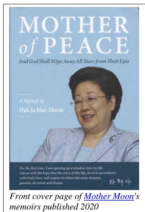
Front cover page of Mother Moon's memoirs published 2020

humankind under God , to become not only God the Father, but also God the Mother, in other words, the Heavenly Parent, turning individuals, tribes, peoples, nations, and the world into heavenly individuals, heavenly tribes, heavenly peoples, heavenly nations, and a heavenly world with God as their Parent.