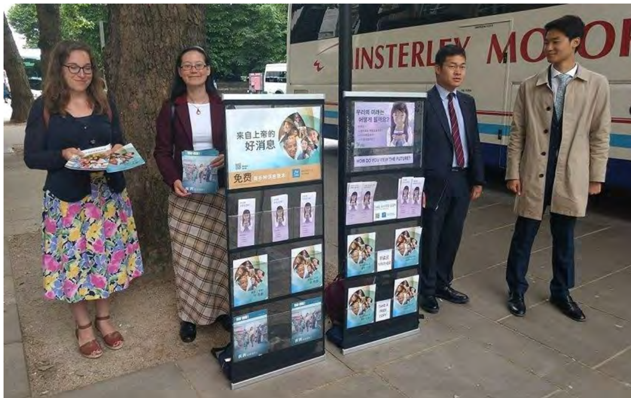
Jehovah's Witnesses outside the British Museum 30th May 2017

And so they passed the About-Picard law, which incriminate the "abuse of weakness" (abus de faiblesse).