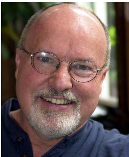
Franciscan Fr. Richard Rohr.

And for a more contemporary take, showing this is a topic about which there's a lot of talk actually, as well as a changing practice today. I was interested to read this. It's from the popular author and the Franciscan, so catholic monk Richard Rohr. He says,