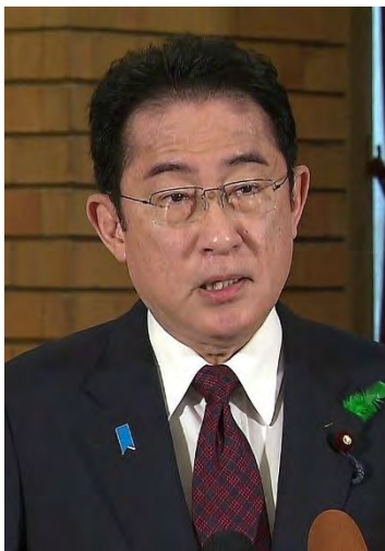
Prime Minister Fumio Kishida swayed by communist campaign. Here, 16th April 2023

Subsequently, Kishida's large party amended its governance code, articulating a policy of "completely cutting off connections with FFWPU and its affiliated organisations". According to Chief Cabinet Secretary Hirokazu Matsuno's statement in the Diet, the term "affiliated organisations" encompasses International Federation for Victory Over Communism (IFVOC).