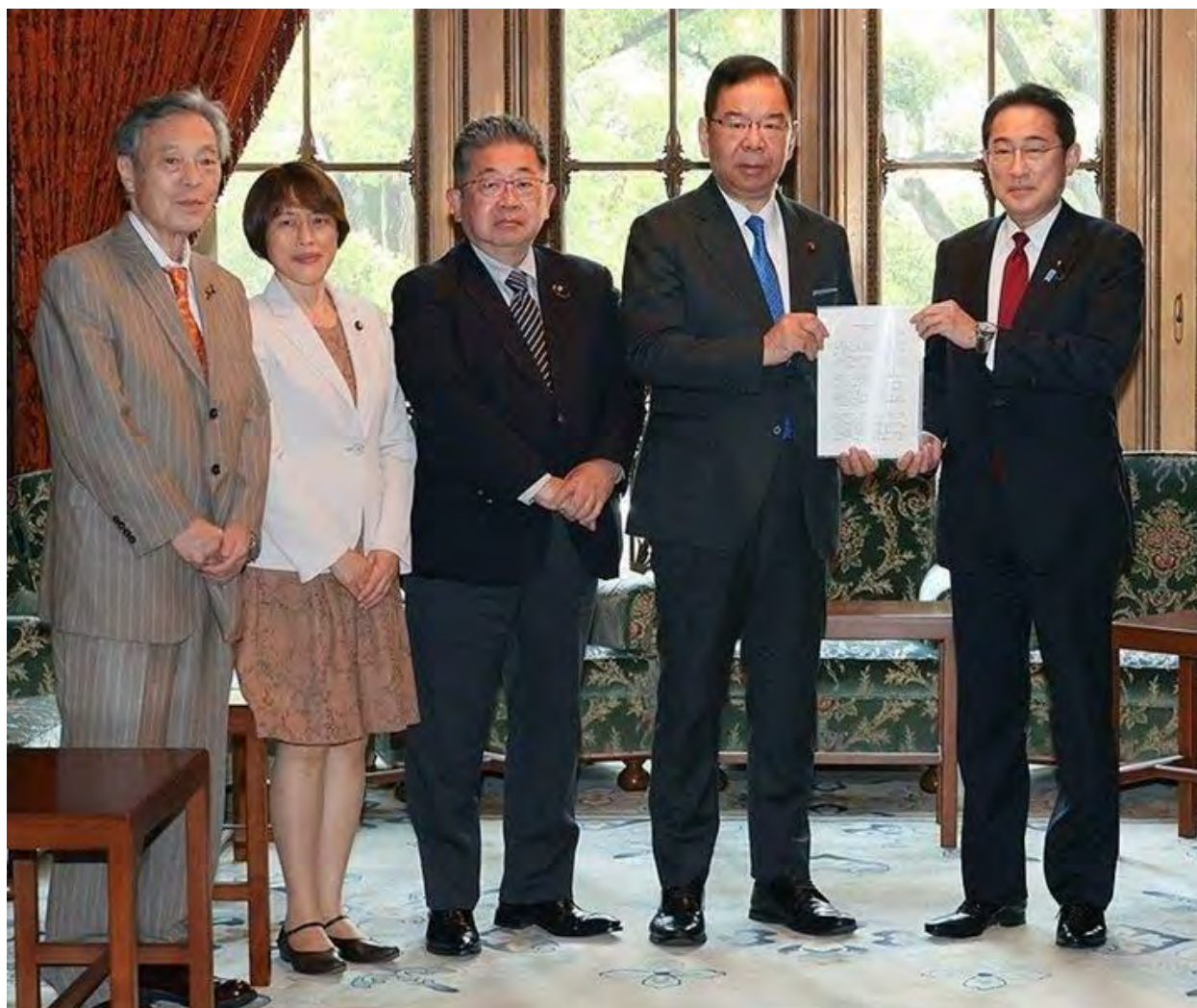
Fumio Kishida (right) with four top leaders of Japanese Communist Party (JCP), from left: Keiji Kokuta, Tomoko Tamura, Akira Koike, Kazuo Shii. Photo (30th March 2023)