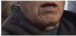
Toshikazu Masubuchi.

of the Liberal Democratic Party (LDP), Toshikazu Masubuchi, who served as speaker of Tochigi Prefectural Assembly 1991-2011.