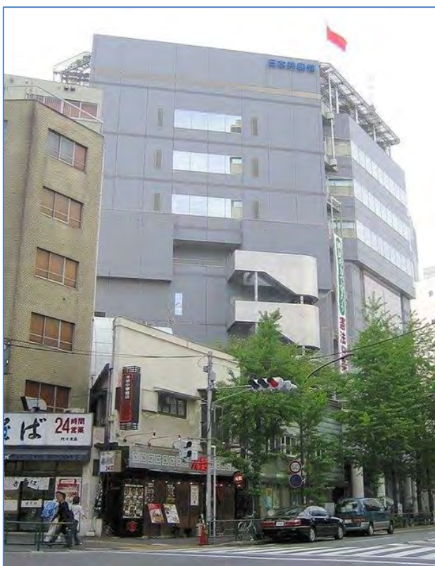
The Central Committee Building of the Japanese Communist Party (JCP) in Shibuya, Tokyo May 2006