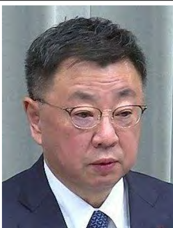
Hirokazu Matsuno, Chief Cabinet Secretary from Oct. 2021 till Dec. 2023

during a press briefing that he, as the head of the governing party, had given instructions to the party's secretary-general to sever connections to the Family Federation .