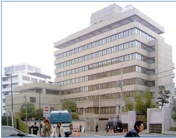
The Japanese headquarters of Chosen Souren (General Association of North Korean Residents in Japan) in Chiyoda, Tokyo, Japan

formerly known as the Unification Church ) as an "anti-social" organization. The majority of the media uses such a defamatory term despite it originally being reserved for certain groups identified by the National Police Agency, such as "yakuza and pseudo-yakuza" and "political extortion groups".