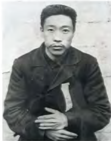
Terrorist in Japan, hero for Koreans: An Jung-geun (안중근), Korean independence activist who assassinated the Japanese prime minister in Harbin, China in 1909.

Having previously read materials concerning events such as the assassinations of President John F. Kennedy and of Japanese Prime Minister Hirobumi Ito in 1909 by Korean activist An Jung-geun [안중근 – 1879-1910, Korean independence activist], I was aware that political motives were always intertwined with how assassination incidents were reported. "