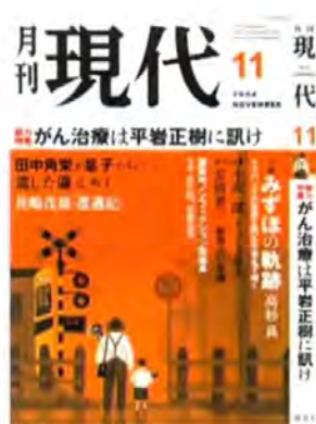
Front cover page of Monthly Gendai Nov. 2004

Kazuhiro Yonemoto (米本和弘) titled "The Untold Story of the Horror and Tragedy of Religious Confinement" (書かれざる宗教監禁の恐怖と悲劇).