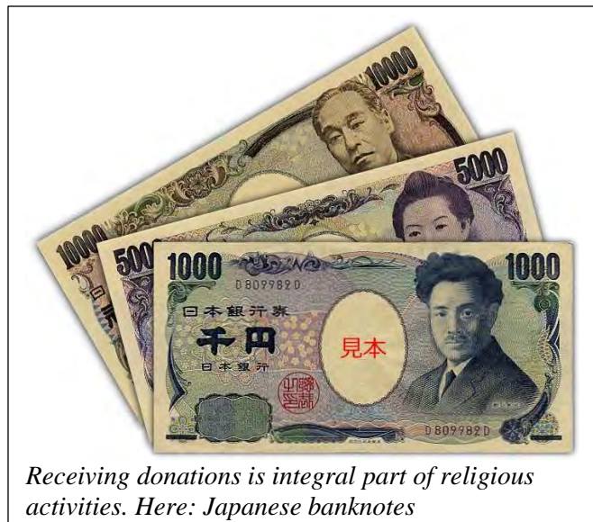
Receiving donations is integral part of religious activities. Here: Japanese banknotes

The Nagoya District Court judgment of April 22, 2014, found the fact that in 1972, our church openly engaged in evangelism as a form of religious solicitation and rejected the claims of the plaintiff in that case. The case in the Tokyo District Court judgment dated February 28, 2020, involved two plaintiffs who sued for activities of FFWPU after 2013, but when they began to learn the doctrine, they were aware that it was the doctrine of FFWPU .