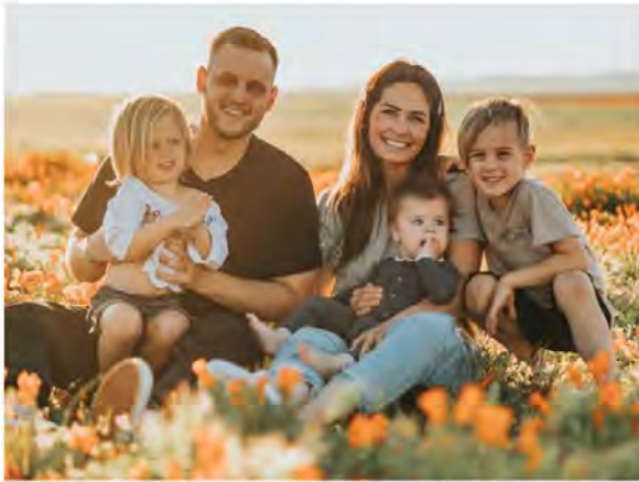
The family is important for the Family Federation.

“We are a religious corporation that celebrates its 64th anniversary this year. There are about 100,000 active believers throughout Japan. They are ordinary Japanese citizens who pray sincerely in the morning and evening, go to church on Sundays to worship, study the Bible and the Unification Principles , our doctrine, work as members of society on weekdays, and socialize with their neighbors.