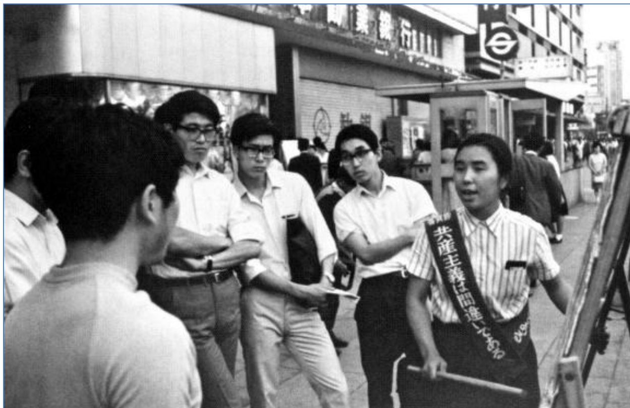
From a Victory over Communism campaign in Japan in 1969, supported by the Unification Church

Politician describes how Japanese communists have been at war with a faith since 1978 election defeat that halted their progress.