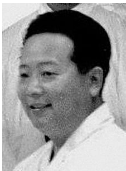
Osami Kuboki in 1969

The experienced politician holds the belief that despite the diversity of religions worldwide, akin to the various climbing routes up Mount Fuji, different religious denominations may vary in approach but ultimately aspire toward the same goal. Therefore, he holds respect for religions beyond Buddhism.