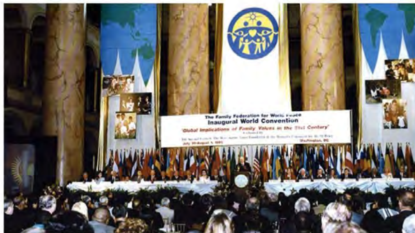
The Inaugural World Convention of the Family Federation 31st July 1996

Moon spoke without a script at the closing banquet the following day, 1st August, at the Sheraton Washington Hotel. His speech was titled "In Search of the Origin of the Universe".