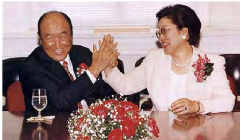
Father and Mother Moon 1st August 1996.

The Family Federation for World Peace and Unification is a global federation of individuals and families who aim to create a world of peace and unity beyond national, cultural, religious and ideological barriers, a world where everyone may live together in peace and harmony.