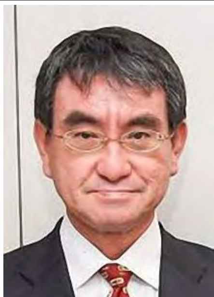
Taro Kono, the government minister who personally appointed hostile lawyers as advisors to the government, is known as a maverick politician. Here in 2019

action and won court cases, which could contribute to an inflated number of individuals falling under this classification. This raises important questions about the rationale and fairness of such definitions within the legal framework.