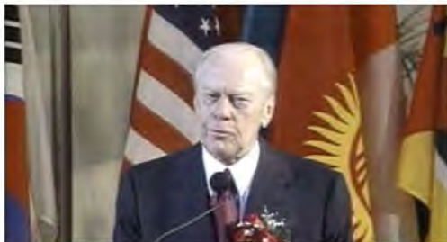
Gerald Ford 31st July 1996

Gerald Ford, U.S. President 1974-1977, spoke at the inauguration 31 st July 1996. He said,