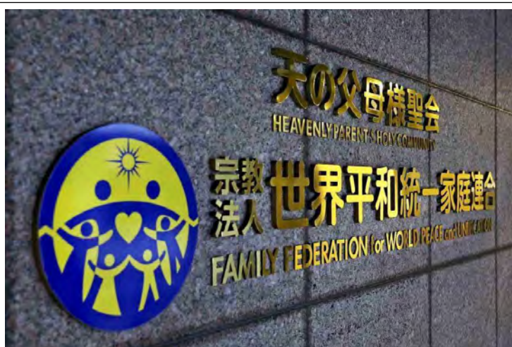
Sign at the entrance of the headquarters of the Family Federation of Japan in Shibuya

There are significant concerns about the effectiveness and fairness of the guidelines in providing clarity on the definitions of "victims" and a "substantial number". The apparent reliance on information from anti-cult organizations and the lack of a robust mechanism for religious organizations to challenge designations or estimates raise serious questions about due process and objectivity.