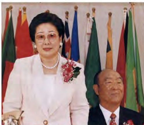
Mother and Father Moon 31st July 1996

The chronicle "40 Years in America" describes the event,