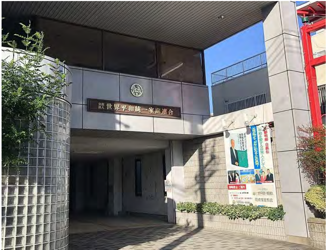
Okazaki Family Church of the Family Federation for World Peace and Unification (Koseidori Higashi, Okazaki City, Aichi Prefecture)

Extreme definition of "victim" sold to Japanese authorities by hostile lawyers may well net them earnings beyond their wildest dreams