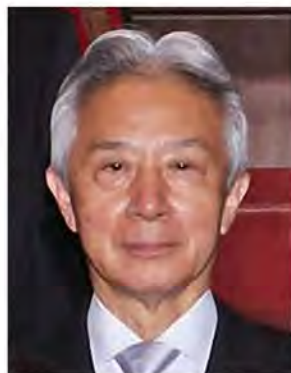
Masahito Moriyama, Minister of Education, Culture, Sports, Science and Technology (MEXT).