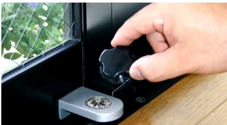
Device making it impossible to open windows

"However, on New Year's Eve in 2020, when he returned home, he encountered a strange situation. In the evening, his uncle and aunt visited, stating, 'We want to discuss your future with relatives.' Six people, including his parents and brother, gathered for a discussion. At that moment, his brother said, 'We want to talk without any interference. Please give us your mobile phones.' Hearing stories from CARP leaders about many believers being abducted and forced to resign in the past, he felt uneasy. However, he never expected to be confined at home. For the time being, he handed over his two mobile phones to his brother."