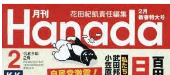
Front page of Monthly Hanada February 2024

There are still abductions of members who are then forcibly detained nine years after landmark Supreme Court victory