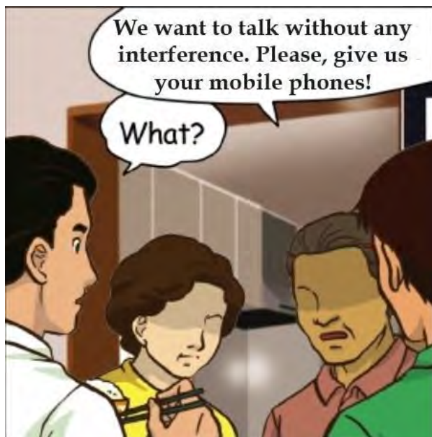
Illustration of a member of the Family Federation being forcibly detained by his parents and relatives

There are still abductions of members who are then forcibly detained nine years after landmark Supreme Court victory