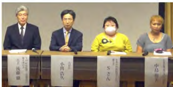
Victims of abduction, forcible detention, and faith-