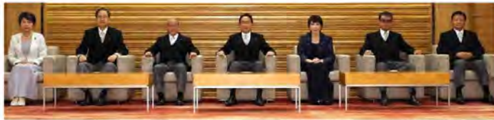
Some of Fumio Kishida's administration, 13 th Sep, 2023. Photo: 首相官邸ホームページ / Wikimedia Commons. License: CC BY 4.0 Int. Cropped

Extreme China-inspired leftwingers rejoicing as Kishida administration introduces laws for mass deprogramming tens of thousands with "wrong views"