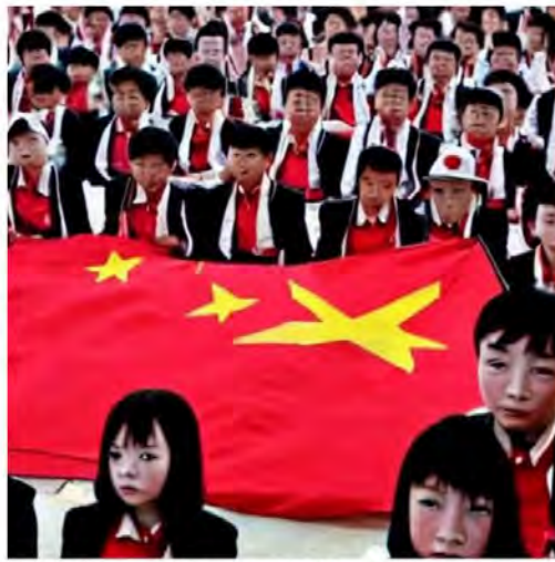
Artistic rendering created by AI Image generator of Chinese communist party indoctrination.

This approach mirrors practices in authoritarian states like China and Russia, where state-sponsored