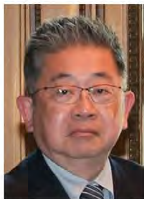
For mass deprogramming: Akira Koike, 30th March 2023.

"In fact, we learn from the official website of the Japanese Communist Party that on October 16, 2023, the 'Minister of Education, Culture, Sports, Science and Technology Masahito Moriyama visited the office of Akira Koike, Secretary General of the Japanese Communist Party, at the House of Councilors, and reported that he had requested the Tokyo District Court to order the dissolution of the