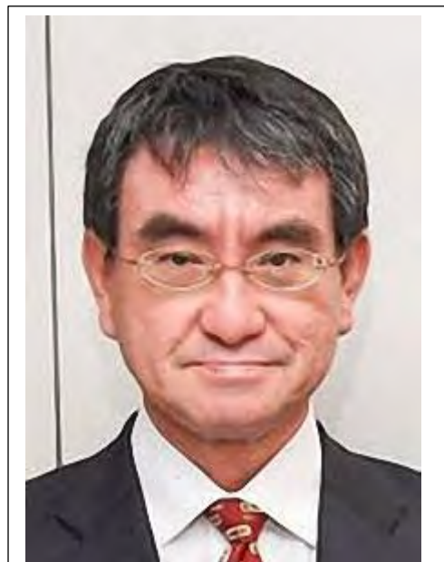
Known as a maverick politician - Taro Kono in 2019