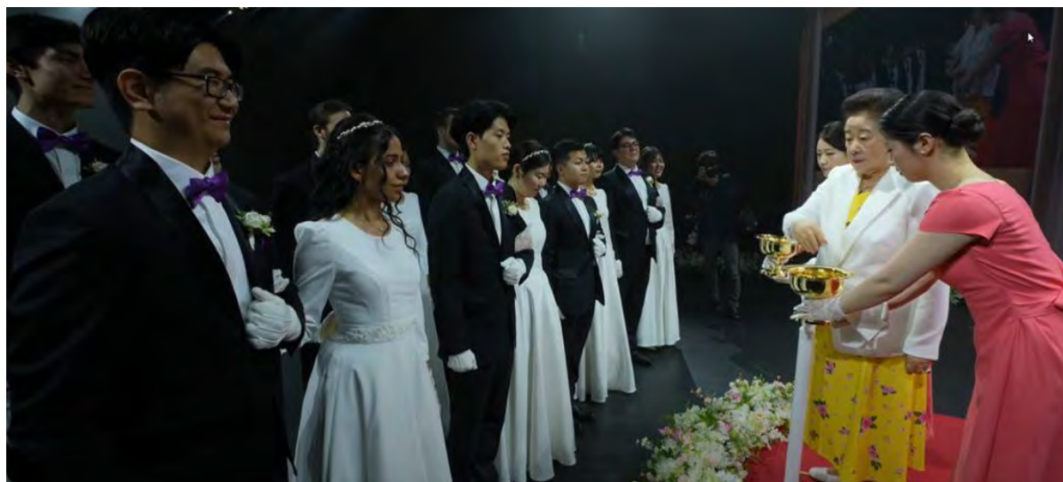
Mother Moon sprinkling holy water on representative couples 15th Feb. 2024

The first part of the ceremony after Mother Moon had entered the stage through two lines of attendants, was the sprinkling of holy water on all the couples. Representative couples were on stage in two lines in front of Hak Ja Han . Attendants sprinkled the water on the other couples. Mother Moon then read the Affirmation of the Blessing Vow, to which everyone shouted a loud yes. Essentially, they promised to do all they could to be a loving and responsible spouse, establish a harmonious family, that would strive to build the kind of world that God originally envisioned, an ideal world where the family is the cornerstone.