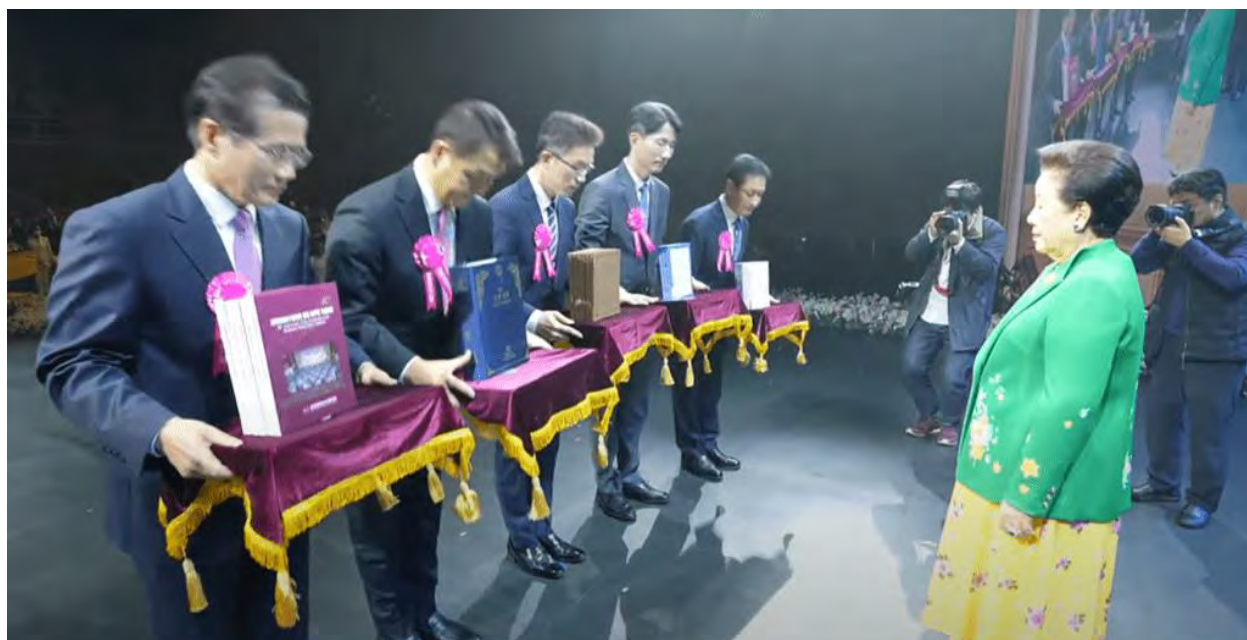
New publications in Korean being presented to Mother Moon on her birthday 15th Feb. 2024