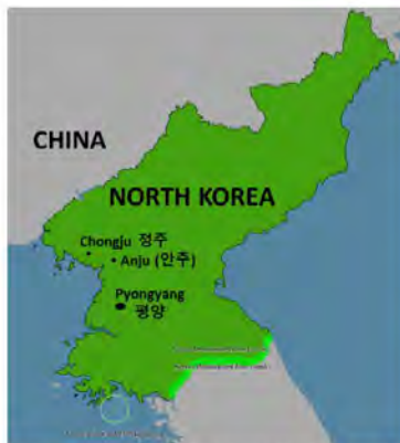
North Korea. Public domain image. Cropped

Dr. Hak Ja Han was born on 10 th February 1943 (6th day of the first month according to the Oriental lunar calendar) in the village of Shineui in the district of Anju in present day North Korea. Her parents were committed Christians. She became an only child because her parents were separated due to political unrest.