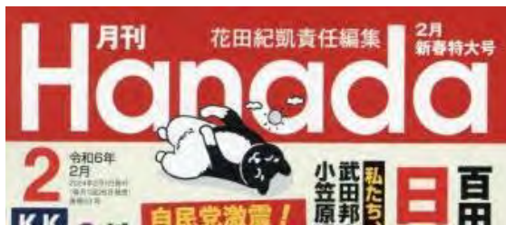
Caption of front page of Monthly Hanada February 2024

Investigative journalist interviews Japanese members about their big donations