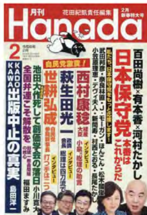
Front cover page of Monthly Hanada Feb. 2024.

Masumi Fukuda maintains that in essence, soliciting donations for religious purposes should be acceptable as long as it's not coercive or extortionate. Unlike cases where dissolution orders were granted, such as the Myokaku-ji [temple near Osaka belonging to Nichiren Buddhism ] case, the Family Federation hasn't faced criminal charges or fraud allegations under the Penal Code or Civil Code.