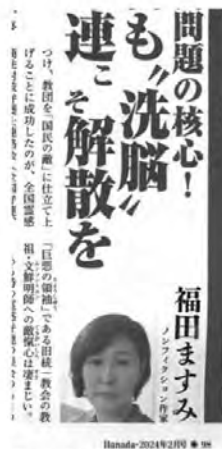
Facsimile from page 98 of the February 2024 issue of Monthly Hanada .

On the other hand, it's likely shocking for the Family Federation to hear that their "systematic solicitation of donations" is cited as grounds for a dissolution order, potentially violating Article 81, Paragraph 1, of the Religious Corporations Act . Critics argue that excessive donations to the Family Federation , deemed unnecessary by some, contradict the true purpose of religious organizations. However, donations are crucial for fulfilling the fundamental purposes of religious groups such as spreading teachings, conducting ceremonies, and educating believers.