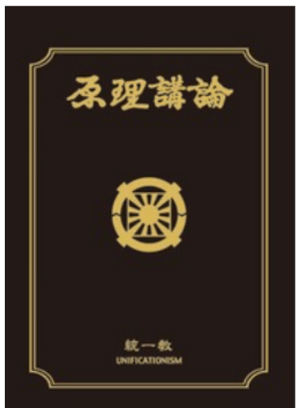
Front cover page of one version of Unification Principles in Japanese

church merely informing members of upcoming projects without coercion or threats. However, she acknowledges the frustration of being faced with false accusations in legal battles, where the plaintiff's claims often overshadow evidence presented by the church's members.