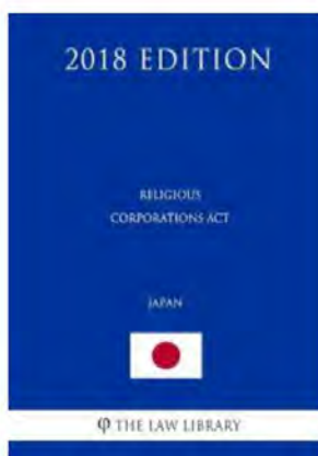
Front page of 2018 English version of Religious Corporations Act of Japan .