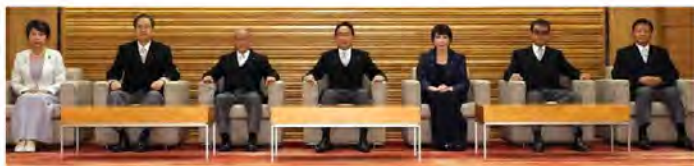
Some of Fumio Kishida's administration, 13 th Sep. 2023.

Extreme China-inspired leftwingers rejoicing as Kishida administration introduces laws for mass deprogramming tens of thousands with "wrong views"