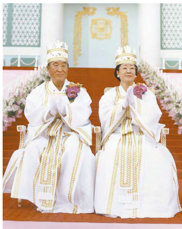
Father and Mother Moon at the 7th February 1999 huge blessing ceremony

On 7th February 1999, at the Seoul Olympic Main Stadium , an extraordinary event unfolded. 150,000 people gathered to witness a momentous occasion: a Blessing Ceremony , also described as a mass wedding . This event, presided over by Father and Mother Moon was a celebration of love, commitment, and unity.