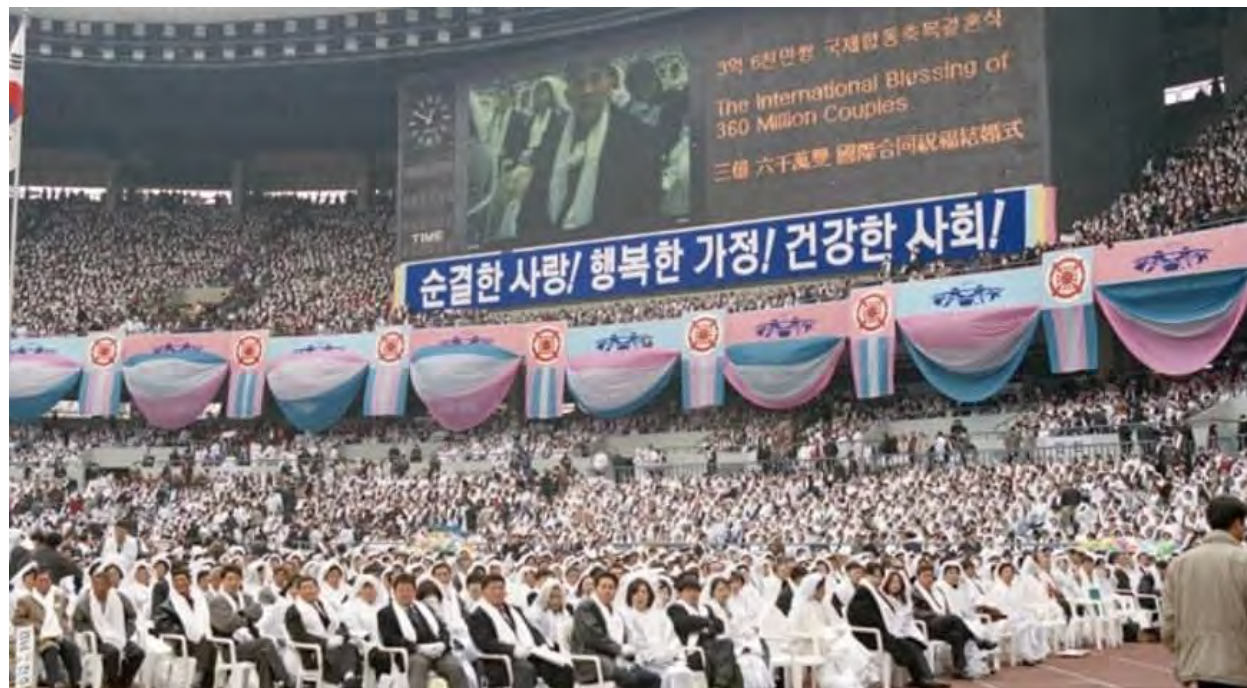
Marriage Blessing 7th Feb. 1999 in the Olympic Stadium in Seoul, South Korea