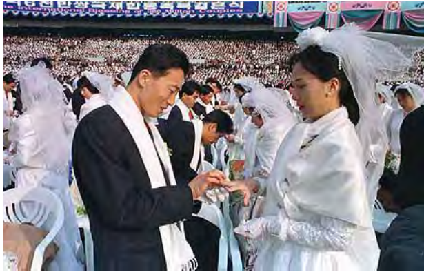
One of the couples exchanging rings 7th Feb. 1999