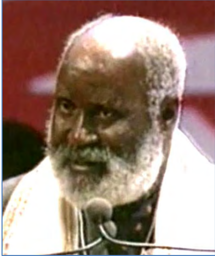
Kenneth Kaunda (1924-2021), the first President of Zambia from 1964 to 1991. Photo (1998)