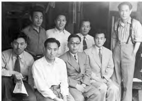
Sun Myung Moon with early followers in 1954

The movement began to be called the "Unification Church", which is far easier to say than the original long name. Sun Myung Moon himself also began to use this name, although he