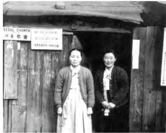
First meeting place in Seoul

However, the Unification Church was discontinued in 1997. Then Father Moon declared that it had served its purpose. He claimed that the age of the different religions was over, and that we therefore no longer needed a