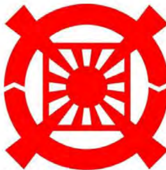
The Unification Church logo

Father Moon first turned to the Christian world, which he believed should have a central role in the work to realize such a vision. Large parts of Christian teachings coincide with his own message. At that time, he explained what he was teaching, by frequent use of Bible quotations. Many Christians then also began to follow Father Moon.