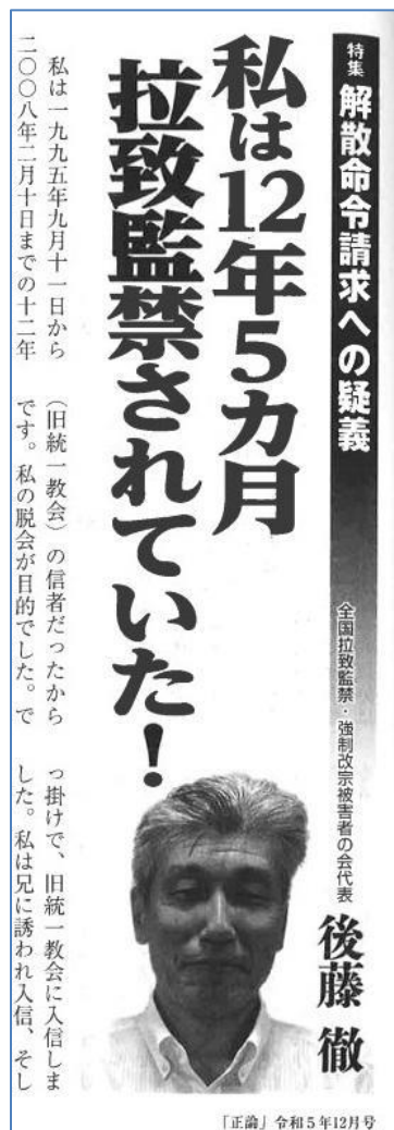
Facsimile from page 53 of Monthly Seiron Dec. 2023.

6th of six parts of large Monthly Seiron report - More on part 1 , part 2 , part 3 , part 4 , part 5 .