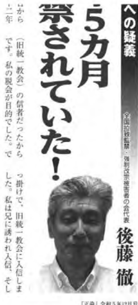
Facsimile from page 53 of Monthly Seiron Dec. 2023.

unbelievable in today's Japan. However, in my case, in a civil lawsuit that I filed, the High Court ruling in favor of the plaintiff was finalized by the Supreme Court on September 29, 2015. In that ruling, the fact of my 12-year and 5-month abduction and