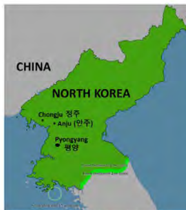
North Korea. Public domain image. Cropped