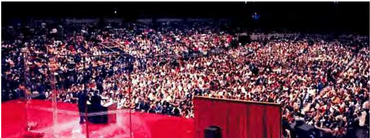
Father Moon speaking in Madison Square Garden, New York 18th Sep. 1974