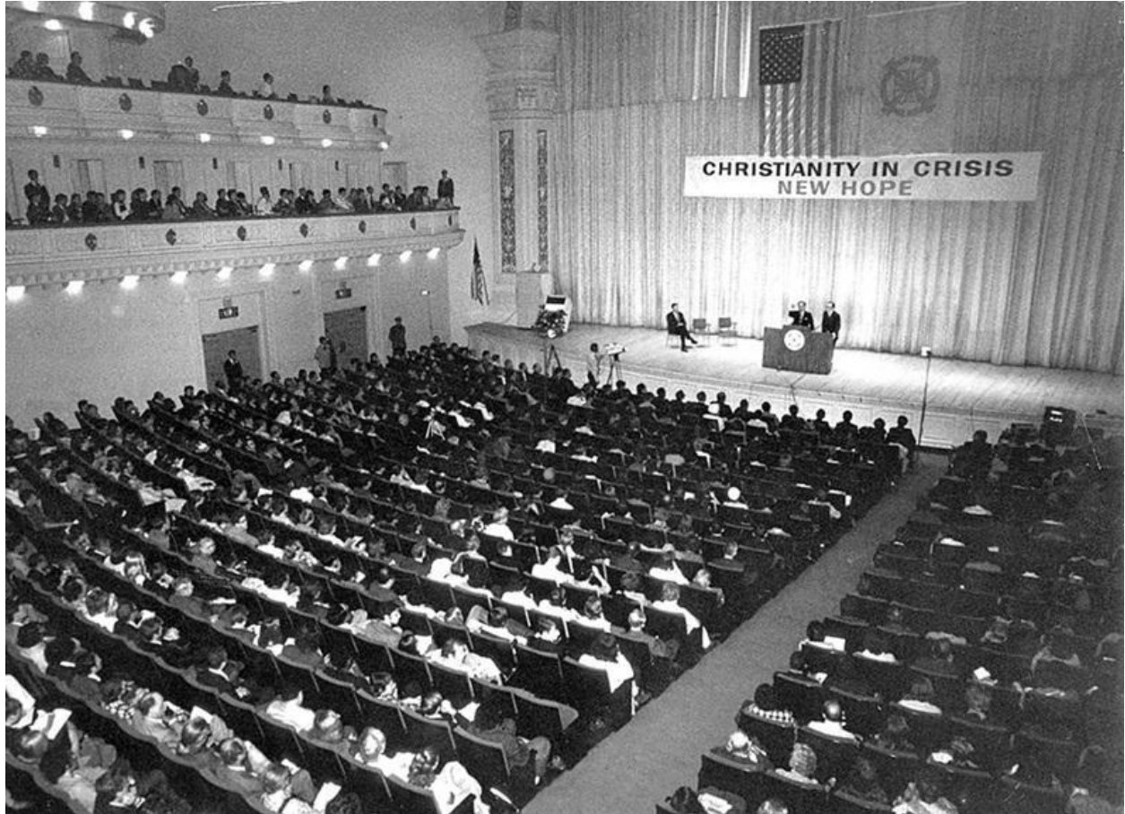
Father Moon speaking at Carnegie Hall, New York 1st Oct. 1973