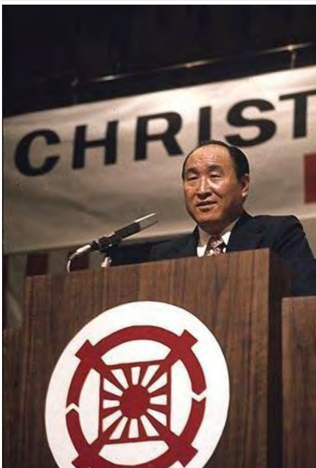
Father Moon speaking during 21-city speaking tour 1973/74

It is 50 years since Father Moon 's legendary 21-city speaking tour in the USA from 1st October 1973 to 29th January 1974. The purpose of the tour was to proclaim a new message from God to humanity. At that time, Father Moon was primarily concerned with addressing the Christian world, and the theme was "Christianity in Crisis: New Hope".