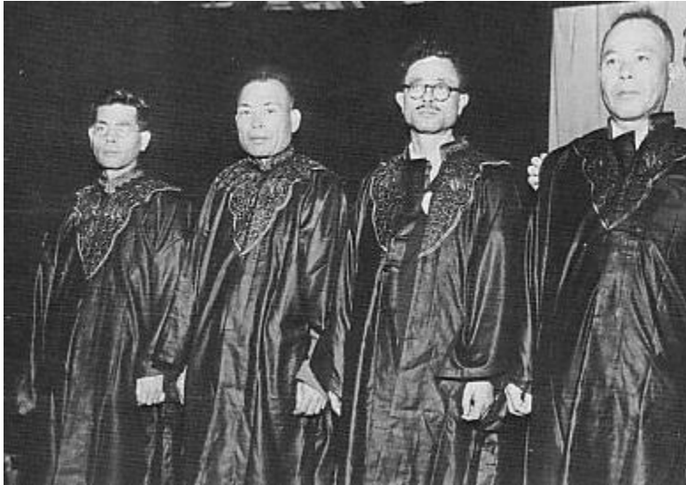
Judges at the Court of Appeals in Okinawa, Japan 1st April 1951

Why do government prosecutors always win? Does Japan Have an Independent Judiciary? Implications for the Unification Church Dissolution Case