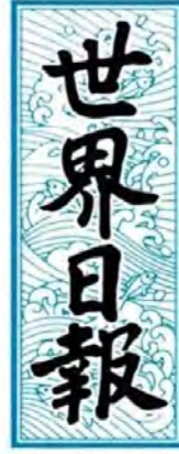
The logo of the Sekai Nippo

– Various media polls show that 70 to 80 percent of the public supports the Ministry of Education, Culture, Sports, Science and Technology's request for an order to disband the Family Federation for World Peace and Unification (formerly the Unification Church).