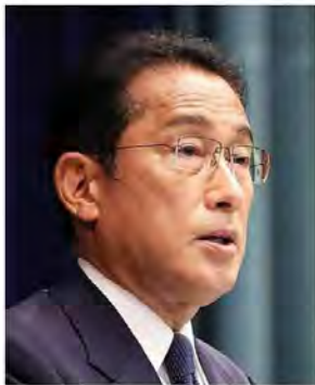
Fumio Kishida 14th July 2022.

– In addition to the media, politics is also largely to blame.