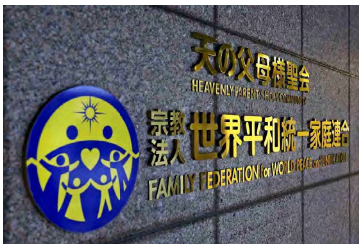
Sign at the entrance of the headquarters of the Family Federation of Japan in Shibuya, Tokyo

- Did your "undercover interviews" make you think that the former Unification Church was a religious organisation that ought to be dissolved?