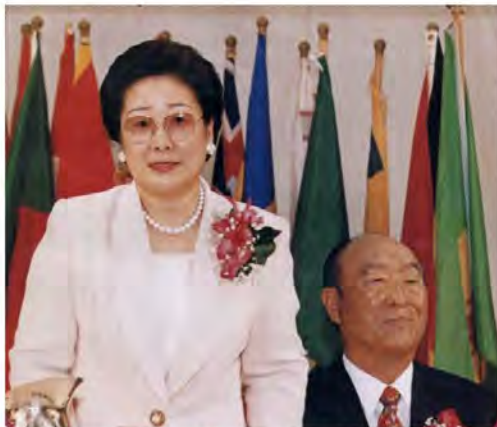
Mother and Father Moon 31st July 1996

The chronicle "40 Years in America" describes the event,