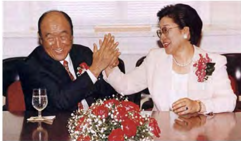
Father and Mother Moon 1st August 1996.

The Family Federation for World Peace and Unification is a global federation of individuals and families who aim to create a world of peace and unity beyond national, cultural, religious and ideological barriers, a world where everyone may live together in peace and harmony.