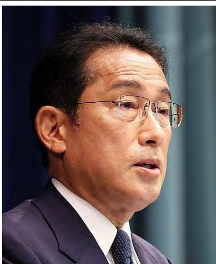
Fumio Kishida 14th July 2022

against the former Unification Church . Even though people have not been harmed or had any unpleasant experiences, they believe media reports and have an image of the religious organisation as "horrible". As I have already pointed out, the people in the media who are involved in reporting, cover neither the religious organisation nor its active believers properly. There is a problem with the provider of the information.