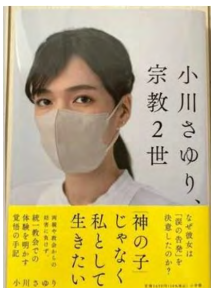
Front page book cover of Sayuri Ogawa's book in Japanese

the former Unification Church , the larger a religious organization becomes, the more unavoidable scandals are.