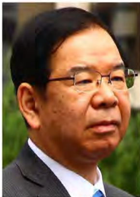
Kazuo Shii in 2017.

In addition to all this, we know that the Japanese Communist Party is the largest communist party in the democratic world with its close to 300,000 members. For 50 years the party has been fighting systematically to destroy the Unification Church .