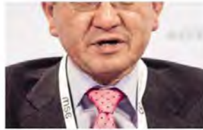
Taro Kono during the Munich Security Conference 2019.

the Unification Church , into an expert panel appointed to deal with the Unification Church issue. This has clearly led to government ministers adopting some of his anti-religious terminology, as shown in the statement by Minister of education, culture, sports, science and technology , Masahito Moriyama, whom The New York Times quotes.