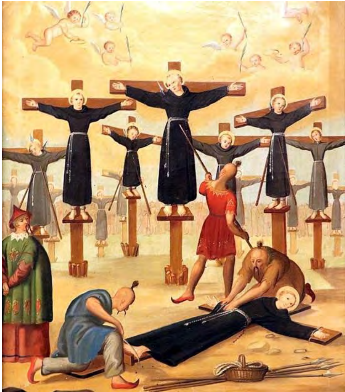
The crucifixion of the 26 Catholic martyrs of Nagasaki, Japan 5th Feb. 1597