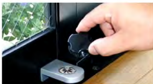
Device making it impossible to open window.

I could go with that pastor to prepare a place of confinement. It was done by the pastor. The windows were locked with a special gadget to make sure they could not be opened. I