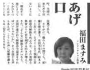
From July 2023 issue of Hanada.

in Japan, the media and the public opinion. For decades, activist lawyers in the network have been using tactics like coercing former members to join their lawsuits against the Unification Church , fabricating evidence, and extorting money from a perfectly legitimate religious movement, that is constantly being persecuted and slandered by those lawyers.