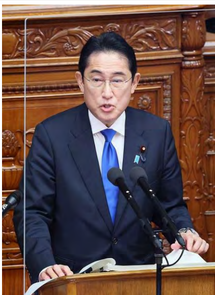
Prime Minister Fumio Kishida being swayed by arguments of hostile lawyers. Japanese Diet 23rd January 2023

(Zenkoku Benren) claims damages of 100 billion yen and argues that "100 billion yen is not enough." However, the actual evidence of harm is almost nonexistent. In reality they cannot go to court because they know they will likely lose if they do.