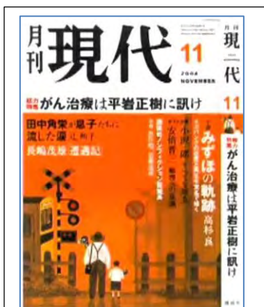
Front cover page of Monthly Gendai Nov. 2004