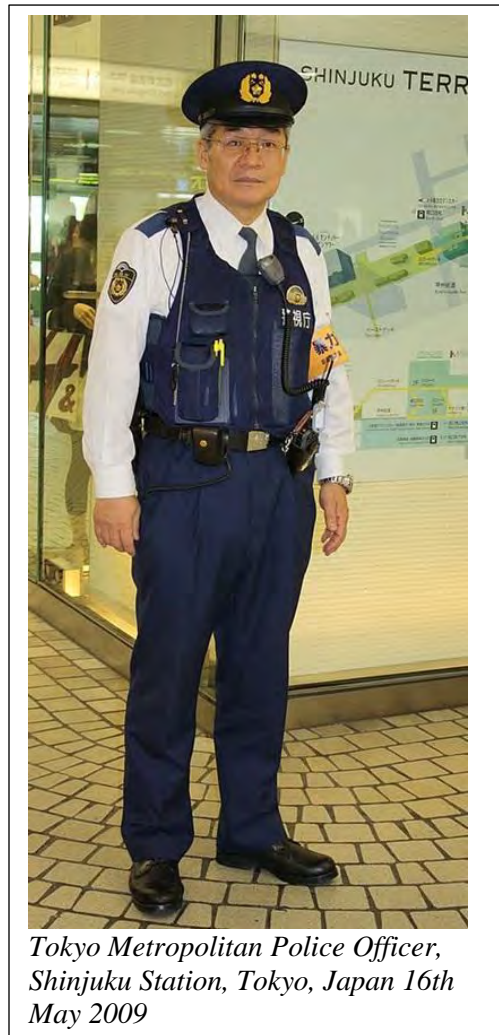
Tokyo Metropolitan Police Officer, Shinjuku Station, Tokyo, Japan 16th May 2009

Japanese police systematically ignored thousands of cases of forcible detention