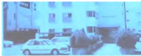
A block of flats in Niitsu where Hirohisa Koide was kept forcibly detained.

hear about what kind of medical treatment was being given at the hospital where there were many believers. They only