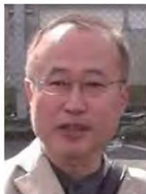
Yoshifu Arita in 2014. Photo: 碧庵 / Wikimedia Commons. License: CC ASA 3.0 Unp . Cropped

Then, in July 1993, Miyamura contacted me and said, "Arita, that Yoshifu Arita [ Born 1952, named Yoshifu after Joseph Stalin, journalist, writer, anti-religious activist and politician for Japanese Communist Party 1990-2007, elected to House of Councillors (Upper House) in the Diet 2010-2022 for Constitutional Democratic Party ] and a reporter from the Weekly Bunshun are going to interview you, is that OK?" I thought, "If I say no, I will be in a position to be killed again." I had no choice but to say yes.