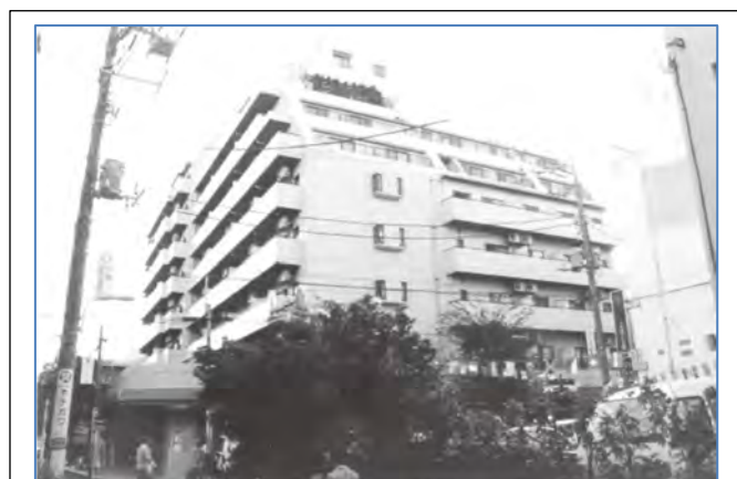
The apartment block in Ogikubo, Tokyo where Hirohisa Koide was forcibly detained in 1992

This is a photo of the apartment in Ogikubo in Tokyo where I was first confined. (Photo shown) It is a very ordinary apartment. I was 29 years old and working at a general hospital in Tokyo.