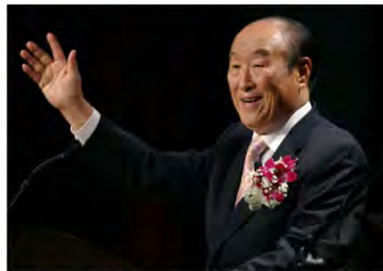
Father Moon 25th June 2005

"We have a mind. The mind is invisible and may not appear to exist, yet it exists. Does it exist in the head or in the heart? The mind exists throughout your body. It is present in every cell of your body without exception. The same is true for God. Because this world is like His body, He is present everywhere in the world." – From a speech Sun Myung Moon gave 8 th January 1971, quoted from Cheon Seong Gyeong (2005 version), Book 1, Chapter 1.