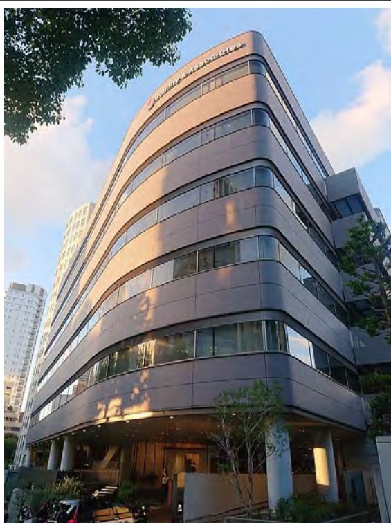
Johnny and Associates headquarters, at 9-6-35 Akasaka, Minato, Tokyo, Japan

healthy discursive space. In this era of a turbulent information environment, we pledge to contribute to the development of democracy." (Yomiuri Shimbun 19th October)