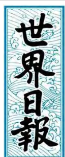
Logo of the Sekai Nippo

Left-wing newspapers have argued that if they continue to report announcements made by governments and other administrative bodies, they will not function as a check on power. There is some truth to that, but it is also too arbitrary.