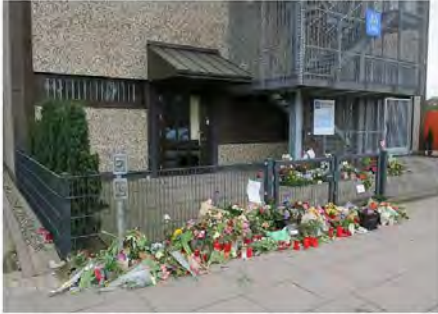
Kingdom Hall in Hamburg-Alsterdorf, ten days after the killing spree on 9th March 2023: damaged door, flowers and candles.

His critical comments are not just directed at so-called “cult experts”, but also at large and influential media outlets, which uncritically let such self-appointed experts market their torrents of hate speech.