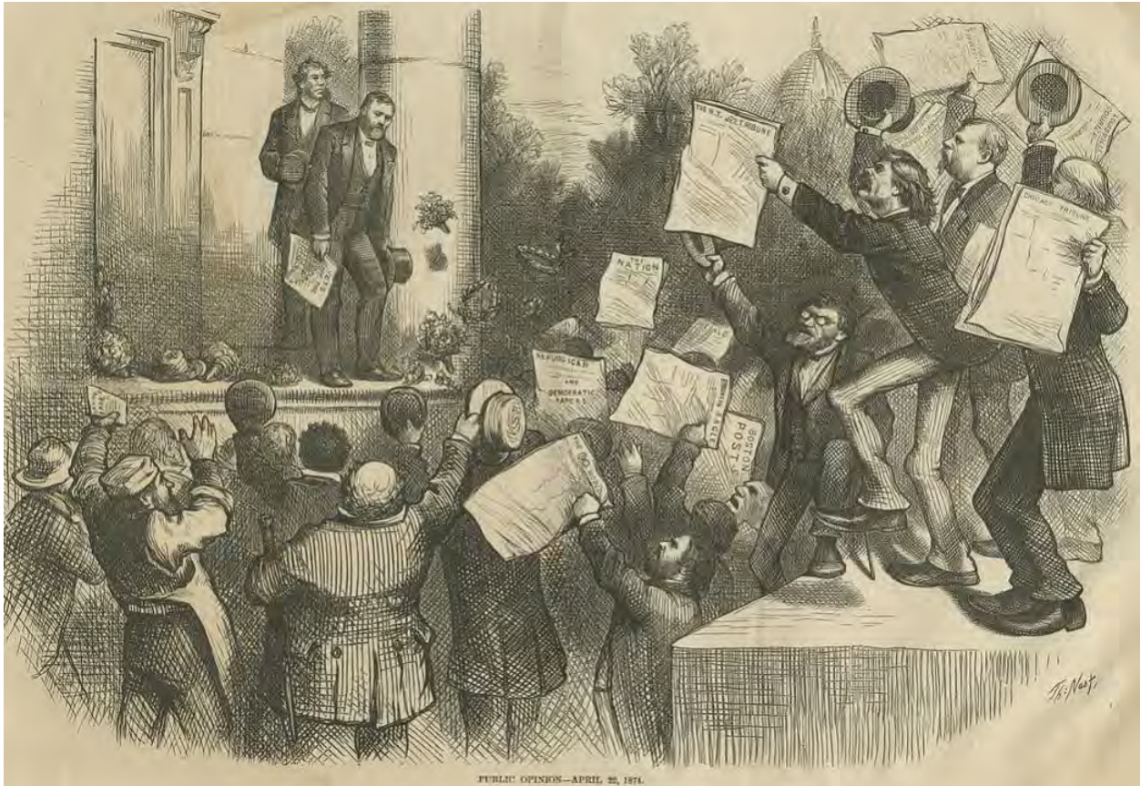
Public Opinion, 22nd April 1874