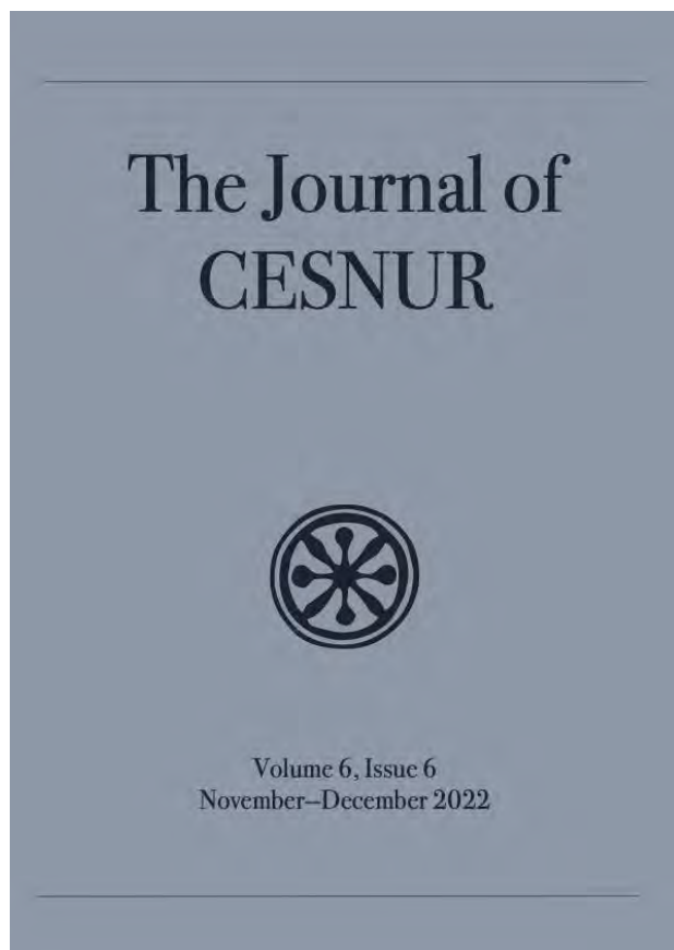
The Journal of CESNUR Nov-Dec 2022

Introvigne explained in a previous article,