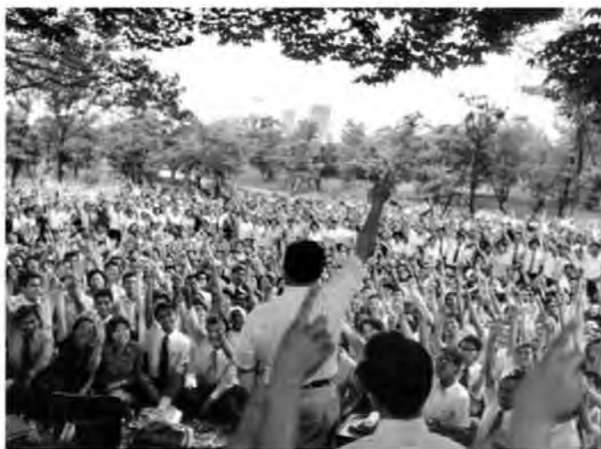
Reverend Moon speaking in Japan in 1973.