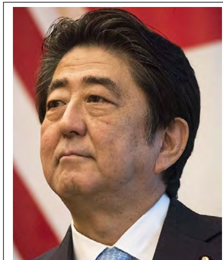
Shinzo Abe in 2017

In fact, the bulk of the article is simply Worth echoing the disinformation story told by an extreme leftwing group of activist lawyers, a network put together in 1987 in order to destroy the Unification Church , now called the Family Federation .