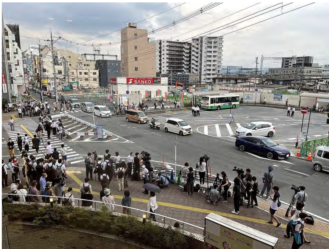
The immediate aftermath of the assassination of former Japanese Prime Minister Shinzo Abe, in the vicinity of Kintetsu Yamato-Saidaiji station northern entrance on 8th July 2022