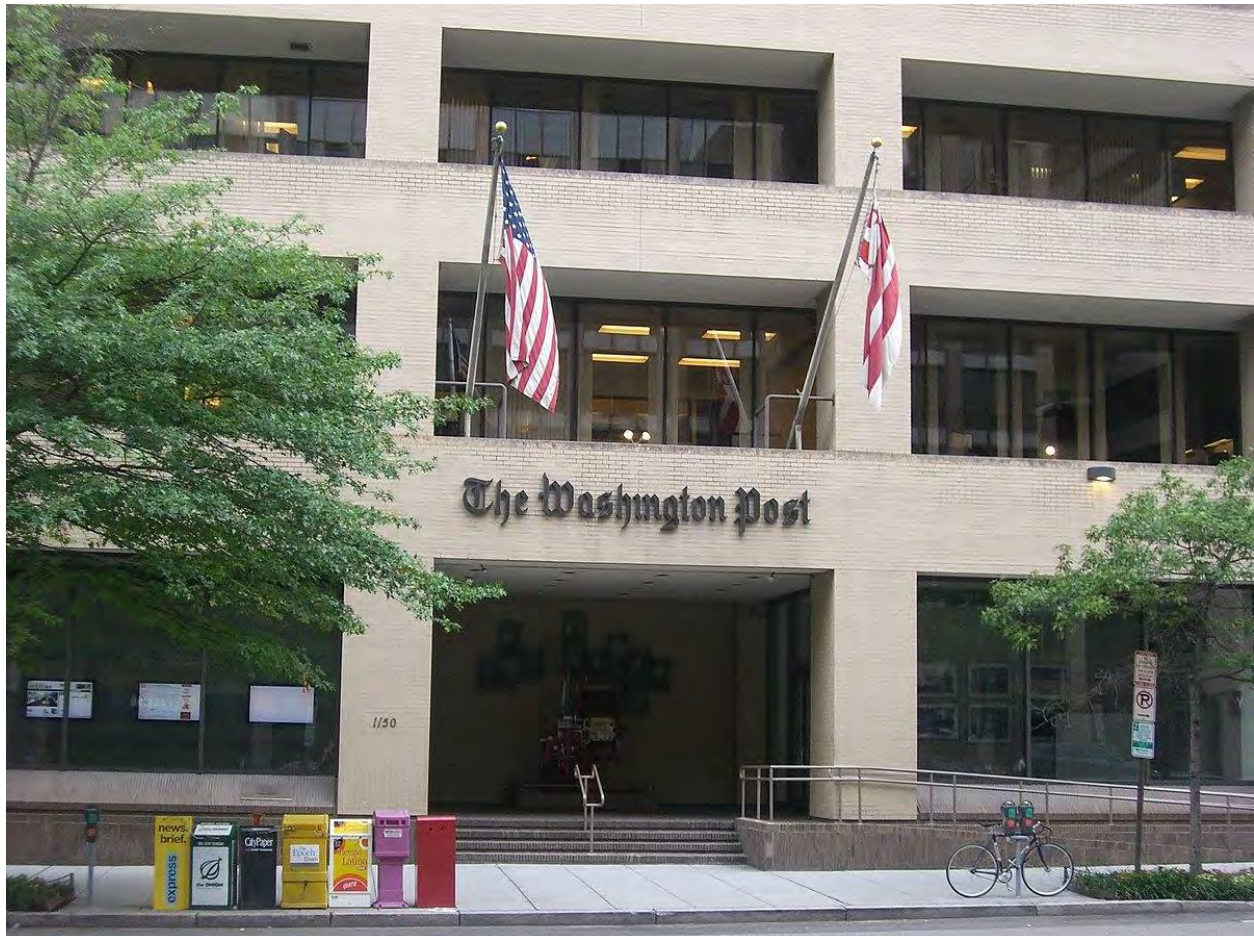
The Washington Post headquarters at 1150 15th St. NW, Washington DC