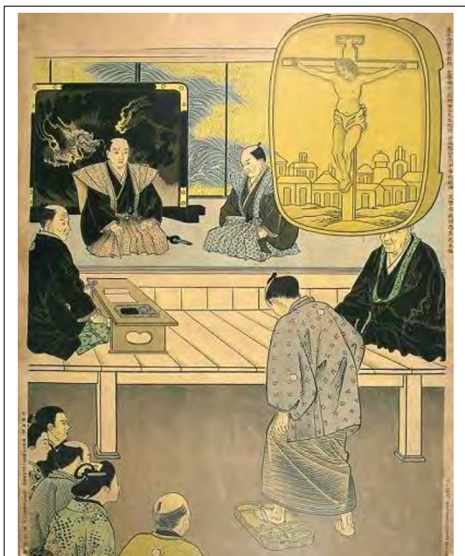
This print shows Fumi-e (踏み絵: fumi "stepping-on" + e "picture"); step on a picture with the likeness of e.g. the Cross of Jesus or the Virgin Mary.