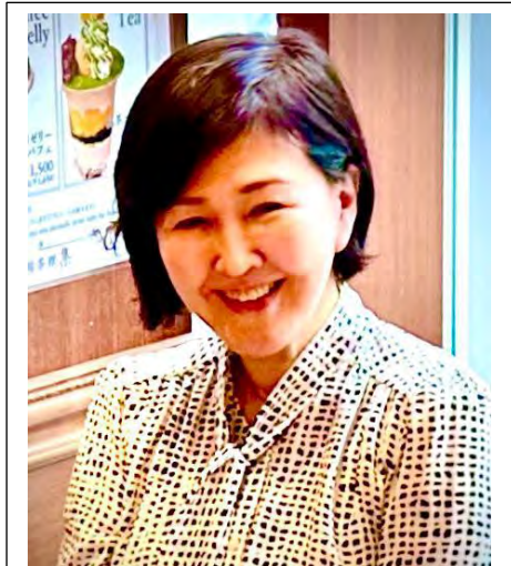
Masumi Fukuda, Japanese investigative journalist