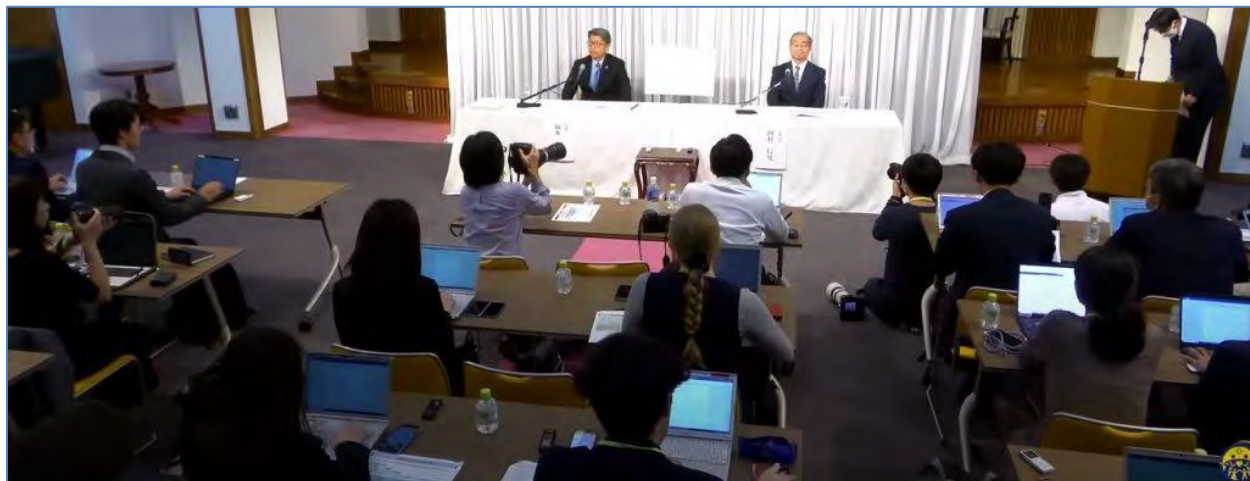
press conference at the national headquarters of the Family Federation of Japan in Shibuya, Tokyo 16th October 2023.

If a religious corporation is to be dissolved, it is a matter of course to clearly state which law and article the religious corporation has acted in breach of.