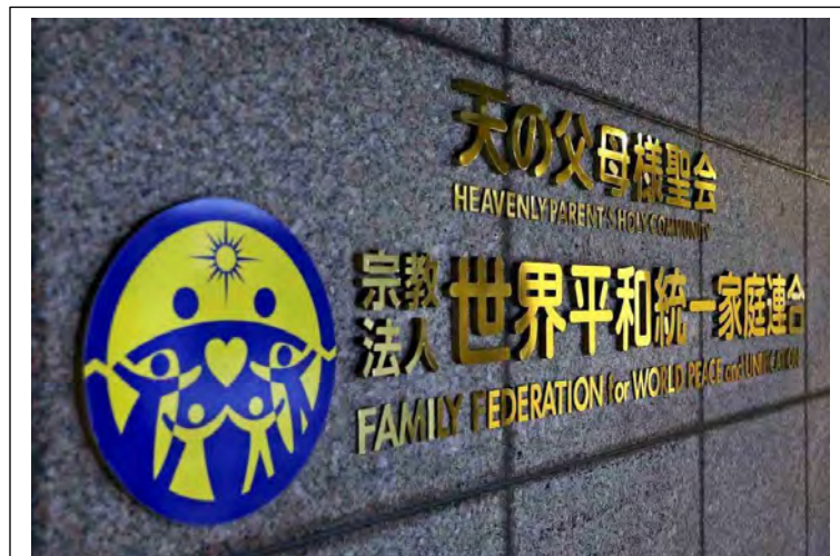
Sign at the entrance of the headquarters of the Family Federation of Japan in Shibuya, Tokyo

Next, the subject of Article 81(1) of the Religious Corporations Act is a religious corporation. However, since a religious corporation does not have a physical body, it cannot be the subject of a crime or illegal act. The question then arises in what cases acts committed by individuals associated with a religious corporation can be considered acts of the corporation.