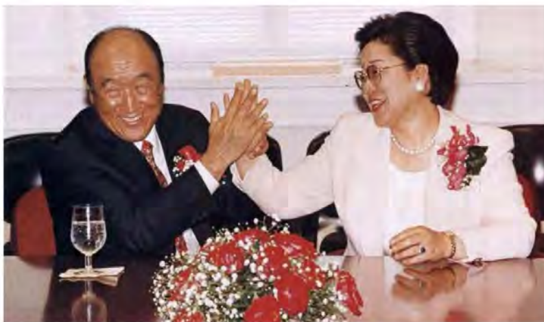
Father and Mother Moon 1st August 1996.

The Family Federation for World Peace and Unification is a global federation of individuals and families who aim to create a world of peace and unity beyond national, cultural, religious and ideological barriers, a world where everyone may live together in peace and harmony.