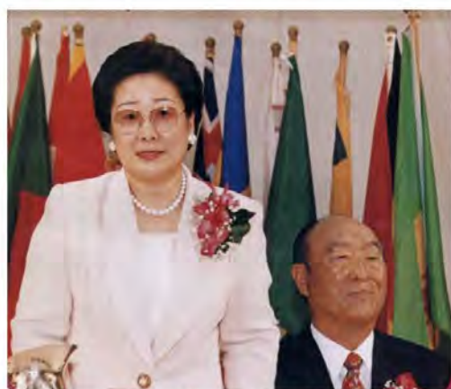
Mother and Father Moon 31st July 1996

"The movement's most spectacular world convention was held in Washington, D.C. from July 30-August 1, 1996, inaugurating the Family Federation for World Peace (FFWP).