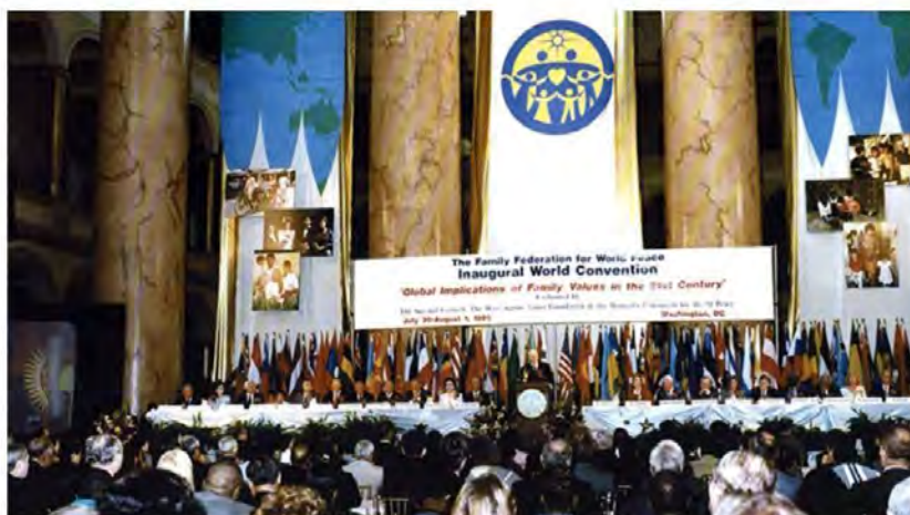
The Inaugural World Convention of the Family Federation 31st July 1996

Moon spoke without a script at the closing banquet the following day, 1st August, at the Sheraton Washington Hotel. His speech was titled "In Search of the Origin of the Universe".