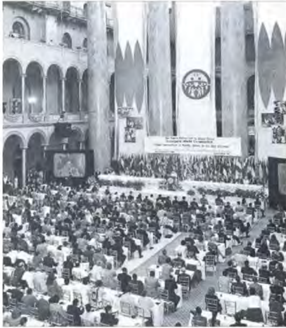
From the Inaugural Convention 31st July 1996.