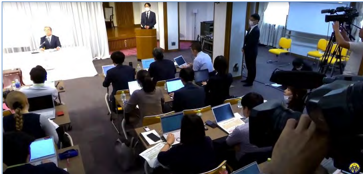
Press conference at the national headquarters of the Family Federation of Japan in Shibuya, Tokyo 16th October 2023