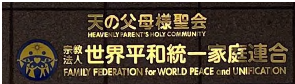
Sign at the entrance of the Family Federation 's national HQ in Tokyo

Personally, I am extremely surprised by the stance of public opinion in Japan against our members. Do they know that countless numbers of Japanese citizens moved to every continent of the globe to serve local villages, towns, cities, communities, and churches? These Japanese citizens are all married, raising healthy families, and instilling values that Japanese culture is known for, such as filial piety, respect for elders, and the mindset of public service for the sake of others. I have not met any other group from Japan that has had as much positive influence around the world. Regardless of people's current religious beliefs, I believe that the Japanese people should be proud of the dedicated, selfless work of the Family Federation .