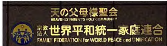
Sign at the entrance of the Family Federation's national HQ in Tokyo.

He explained why there are no reasons for dissolution,