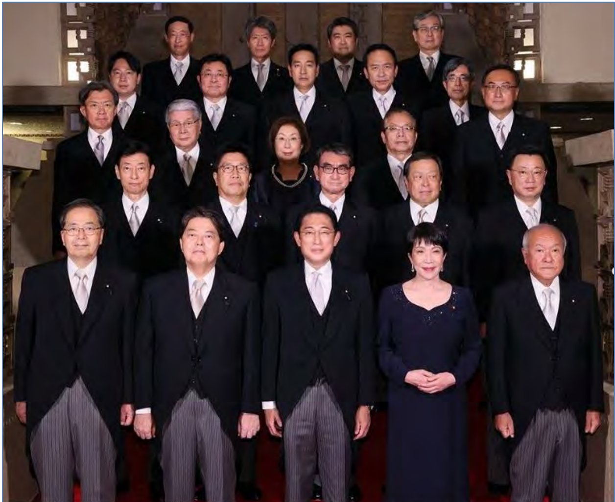
Photo taken 10th August 2022 at the Prime Minister's official residence in conjunction with the inauguration of the second Kishida reshuffled cabinet. Photo: 内閣官房内閣広報室/Wikimedia Commons. License: CC Attr 4.0 Int. Cropped