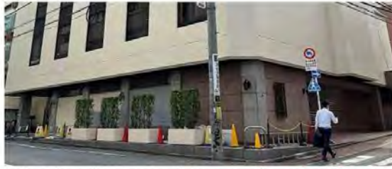
Tokyo headquarters of the Family Federation of Japan .

September 2023 announcement by the Ministry of Education, Culture, Sports, Science and Technology (MEXT) that the Family Federation of Japan would be fined for not answering properly to questions from the ministry, the Family Federation held a press conference the day after, 8 th September, at the national headquarters in Shibuya, Tokyo.