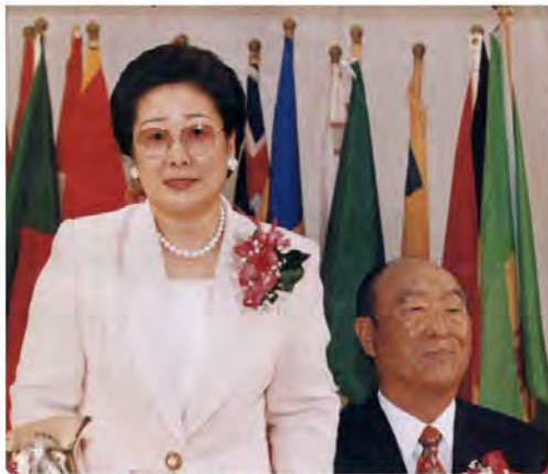
Mother and Father Moon 31st July 1996

The chronicle "40 Years in America" describes the event,