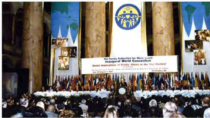
The Inaugural World Convention of the Family Federation 31st July 1996

Moon spoke without a script at the closing banquet the following day, 1st August, at the Sheraton Washington Hotel. His speech was titled "In Search of the Origin of the Universe".