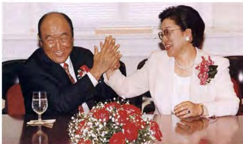
Father and Mother Moon 1st August 1996.

The Family Federation for World Peace and Unification is a global federation of individuals and families who aim to create a world of peace and unity beyond national, cultural, religious and ideological barriers, a world where everyone may live together in peace and harmony.