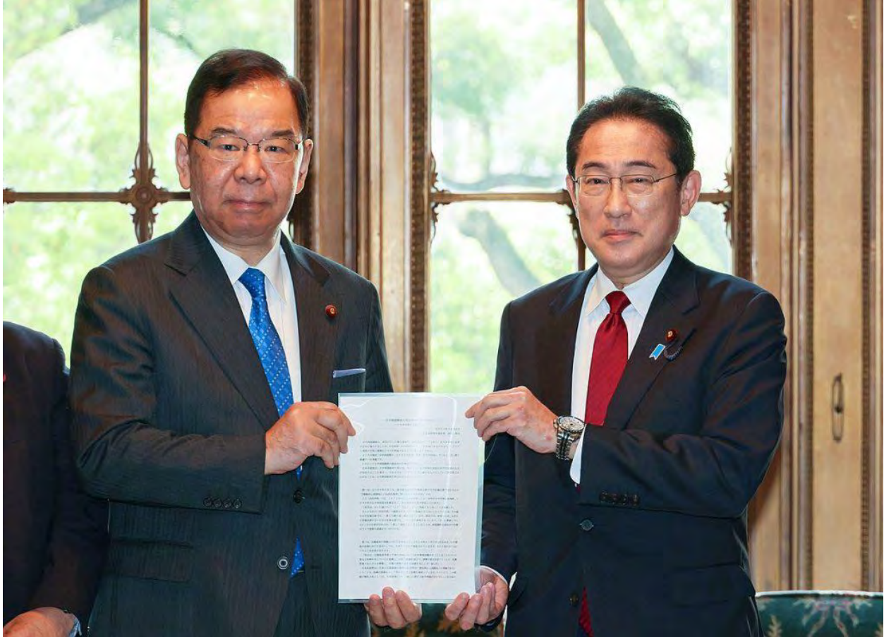
In the Japanese Diet building 30th March 2020, Prime Minister Fumio Kishida receiving the Japanese Communist Party's proposals regarding Japan-China relations from Kazuo Shii, chairman of the Japanese Communist Party (JPC)

When a society unashamedly considers some of its citizens to be only "half," whether because of race, ethnicity, religion or politics, it is already on the dangerous slope to tyranny and oppression. Democracy in Japan is relatively young, and the Kishida government, by willfully ignoring advice from religious and legal experts, parliamentary leaders and others around the world not to proceed with this ill-considered and untimely action, is in danger of bringing Japan and its proud traditions into disrepute.