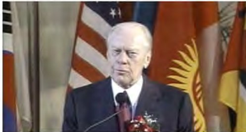
Gerald Ford 31st July 1996

Gerald Ford, U.S. President 1974-1977, spoke at the inauguration 31 st July 1996. He said,