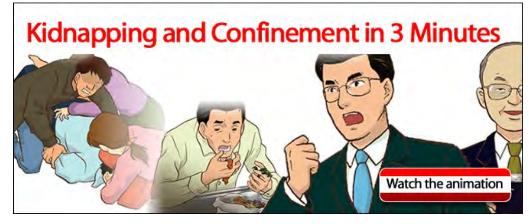
Read PDF version

It is an act of kidnapping people by violent, forcible, and deceitful means, cutting off communications with the outside world while attempting to break their faith and confining them until they renounce their beliefs. The majority of victims are followers of the Unification Church, totaling over 4,300. The main perpetrators include Christian ministers who regard the Unification Church members as "heretics", and lawyers and journalists who are hostile to the Unification movement and the Victory Over Communism movement. They stir up the parents' heart, making them insecure, and demand large sums of money in reward for assisting them "rescue" their children.