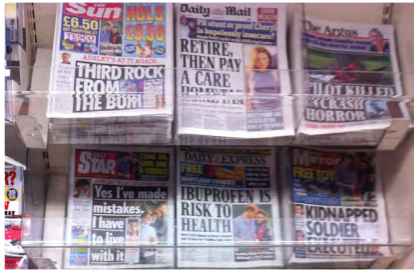
Some of the scandal press - British tabloids 5th July 2011

know that there is money to be made by portraying such movements as bad as possible.