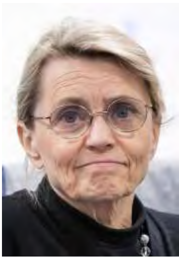
Päivi Räsänen in May 2023