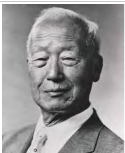
Syngman Rhee in 1956

Therefore, the US had to quickly make a plan for Japan's surrender in Korea. The advisers saw that the 38th parallel divided the country into two roughly equal parts. They proposed that the Soviet Union should deal with Japan's surrender north of the 38th parallel. The United States were to do the same south of this line.