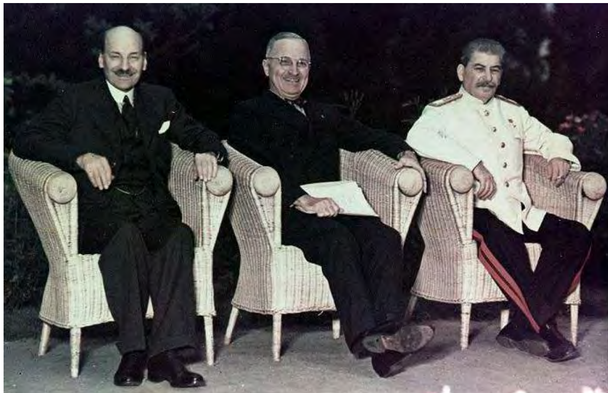
From the conference in Potsdam, Germany July 1945. From left to right: British Prime Minister Clement Attlee; U.S. President Harry S. Truman; Soviet Premier Joseph Stalin

At the Potsdam Conference in July 1945, American military leaders still encouraged the Soviet Union to take part in the war against Japan. Nevertheless, Stalin did not declare war on Japan until 8th August, two days after an atomic bomb had been dropped on Hiroshima. The next day, Soviet forces entered Manchuria and also landed on the north-eastern tip of Korea the same day.