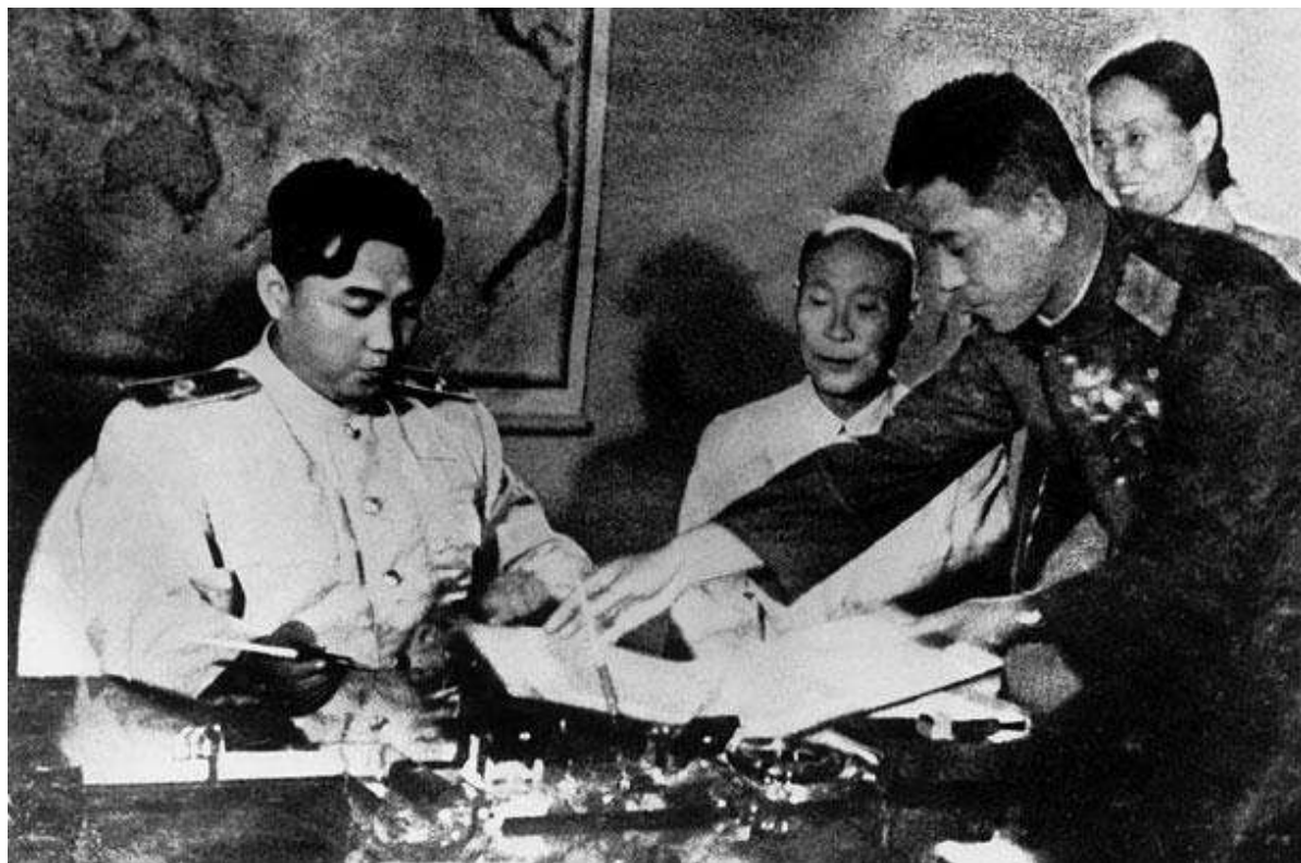
Kim Il-sung signing the armistice agreement ending the Korean War in 1953

We also understand the intensity of the confrontation through the total isolation that exists today between North and South Korea. No passenger traffic between the two states is possible. There is no trade, telephone or postal connection. From 1953 to the present, the two states have accused each other of more than 200,000 violations of the ceasefire agreement.