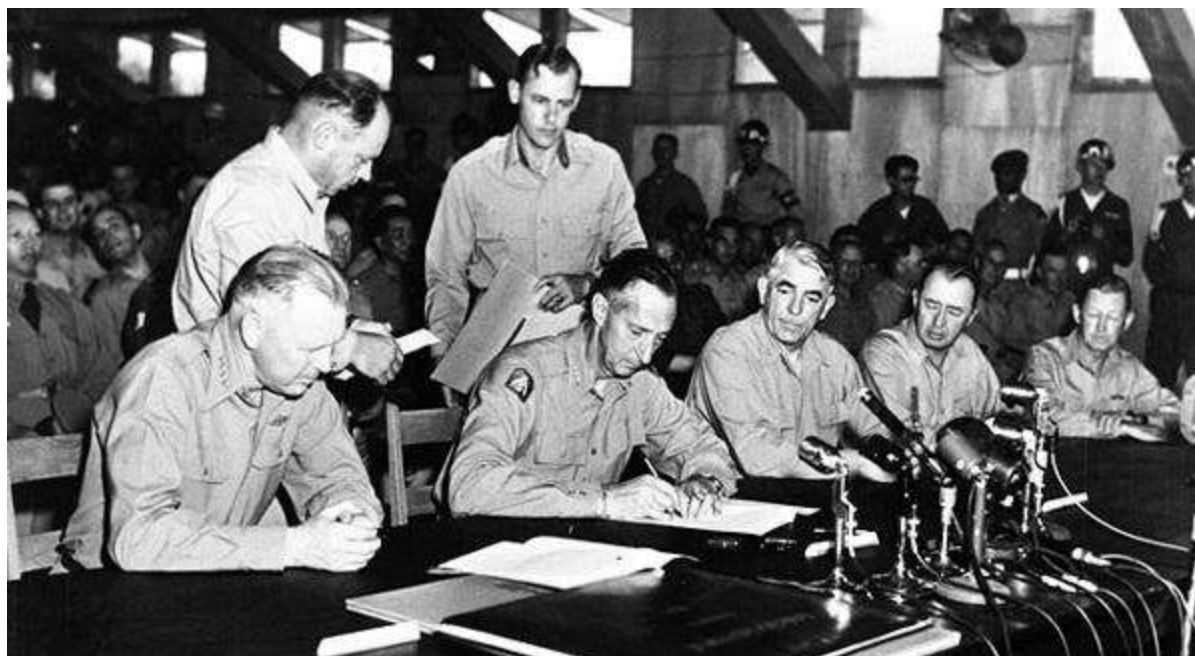
General Mark W. Clark, Far East commander, signs the Korean armistice agreement on 27th July 1953, after two years of negotiation

End of Korean War as armistice was signed 27th July 1953