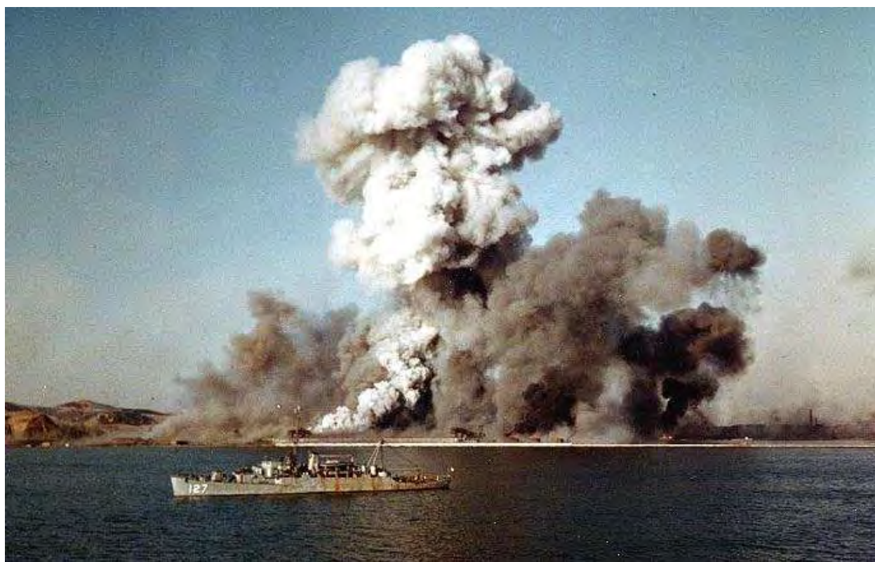
From an attack on Heungnam in 1950. USS Begor in front

The North Korean communists wanted to introduce the same system in South Korea as well, and would have succeeded already in 1950, if the democratic world - representing God 's side in the fight against communism - had not come to the rescue of South Korea in an incredible way. The Soviet Union could have used its veto power in the Security Council and stopped the entire UN resolution. However, God knows why that didn't happen.