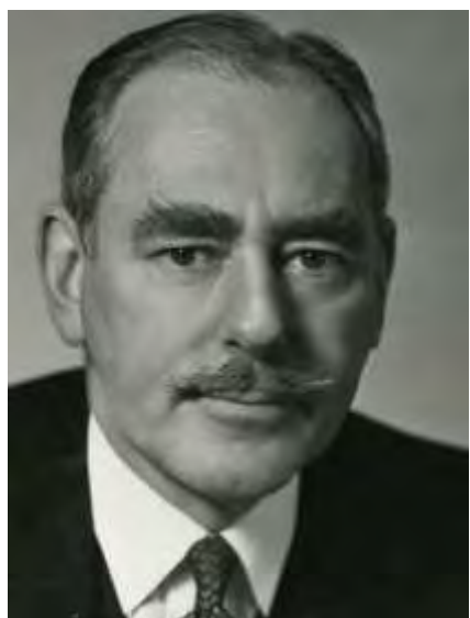
Dean G. Acheson, U.S. Secretary of State, Jan. 1949 to Jan. 1953

defense line in the Pacific region. North Korea, the Soviet Union and China all saw this as an invitation to take South Korea.