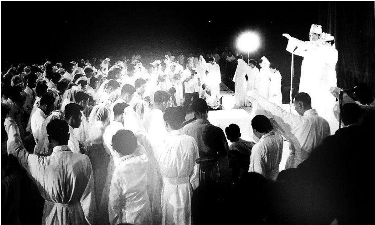
Marriage Blessing ceremony 24th July 1963

Father Moon explained, "establishing the 124 Couples set the condition for God to be able to work in an unprecedented way on the world level. When the number of United Nations member nations topped 120, we entered the Last Days." (Chambumo Gyeong, p. 336)