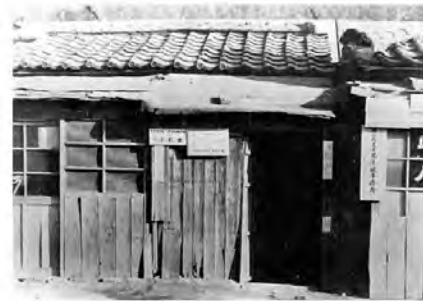
The house with 3 doors

Several members and their families also moved to Seoul. Sun Myung Moon himself went there on 17 th September 1953 and began building a foundation. In the spring of 1954, a place to hold meetings was established, the so-called "House with Three Doors" (391 Bukhak-dong, Seongdong-gu). With this location as its address, the Unification Church was officially registered as the Holy Spirit Association for the Unification of World Christianity [HSA-UWC] on 1 st May 1954.