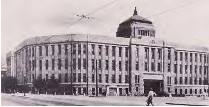
Seoul Citizens' Hall

Through the 124 couples, he said, "we were expanding to set a worldwide foundation" (Chambumo Gyeong, p. 335). Those couples represented the nations of the world.