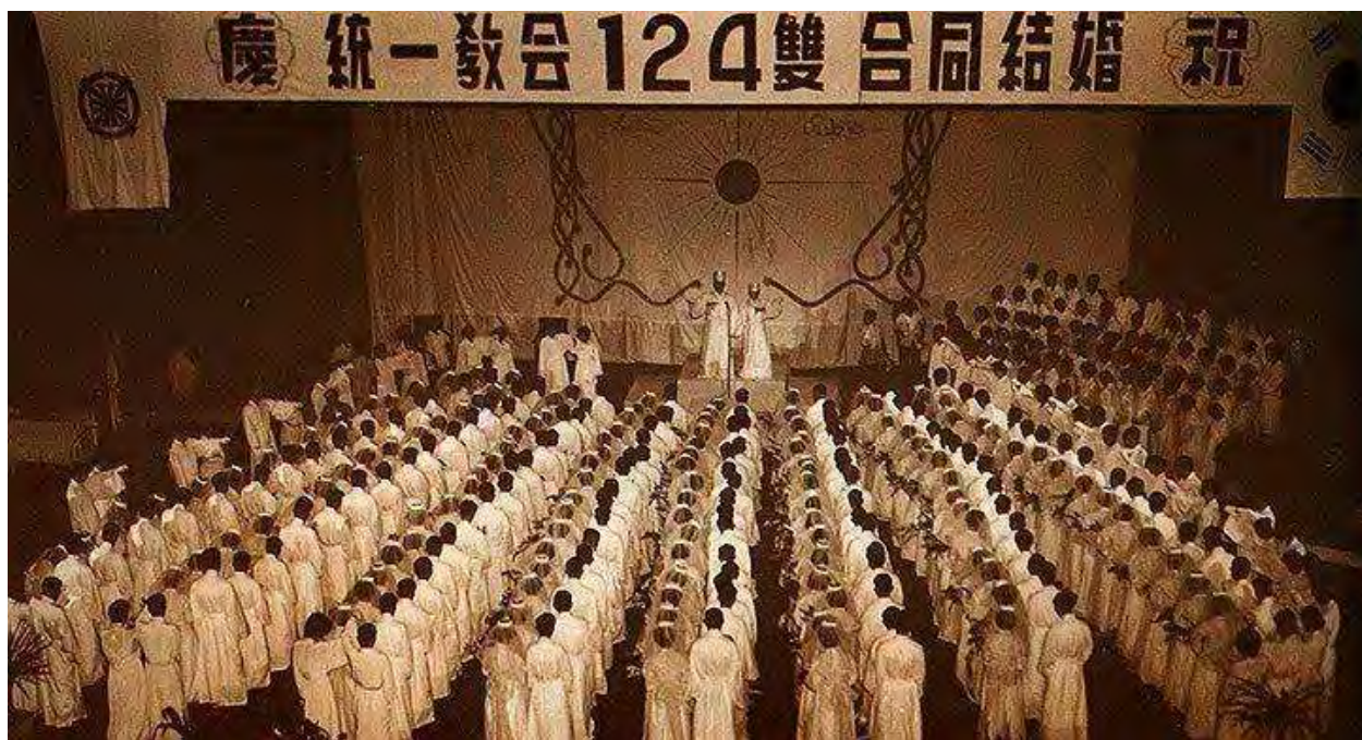
The Marriage Blessing of 124 couples 24th July 1963

This was the first time such a ceremony was held publicly. Up until then, these mass weddings had taken place at the then Unification Church headquarters building at the Cheongpa area in Seoul. The early 1960's was a time the rapidly growing movement Father Moon had founded just few years earlier, went through fierce persecution. And there had been attempts to have the mass weddings stopped, and even have Sun Myung Moon jailed for holding them.