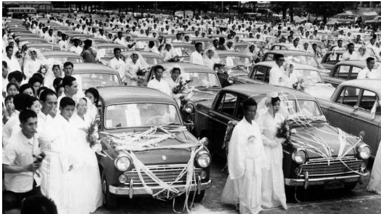
124 couples of 1963 - the first mass wedding held publicly

24th July is a historical day for the Family Federation , and for the brides and grooms who 60 years ago took part in the 124 couples Marriage Blessing Ceremony on that date in 1963, at the Seoul Citizens' Hall.