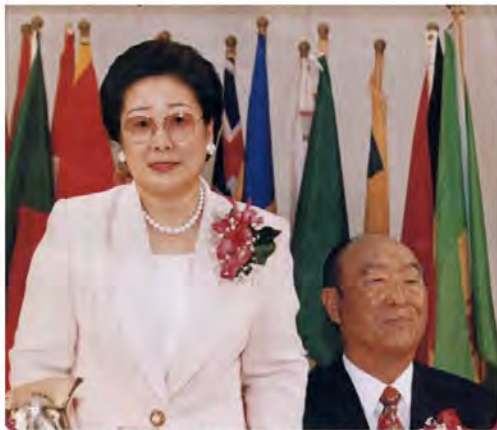
Mother and Father Moon 31st July 1996

The chronicle "40 Years in America" describes the event,