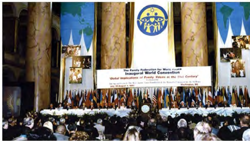
The Inaugural World Convention of the Family Federation 31st July 1996

Moon spoke without a script at the closing banquet the following day, 1st August, at the Sheraton Washington Hotel. His speech was titled "In Search of the Origin of the Universe".