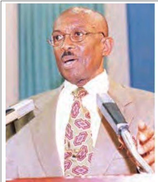
Hamilton Green 13th July 2003 in Cheonan

Hamilton Green, Prime Minister of Guyana 1985-1992, said in his congratulatory address,