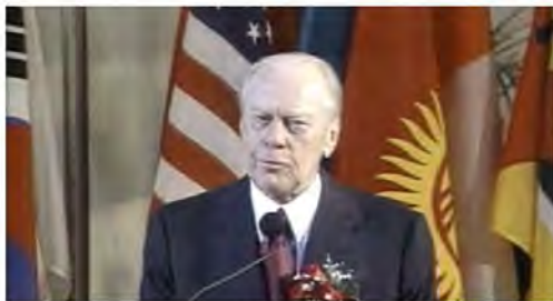
Gerald Ford 31st July 1996

Gerald Ford, U.S. President 1974-1977, spoke at the inauguration 31 st July 1996. He said,