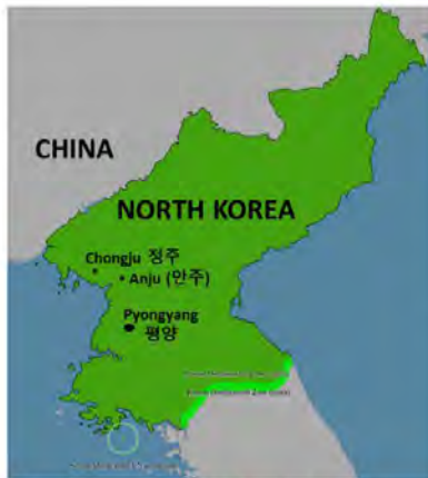
North Korea. Public domain image. Cropped