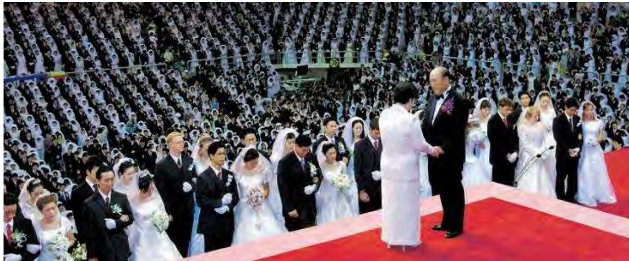
3550 couples at 2003 Blessing in South Korea, 30,000 globally

We congratulate all the couples who took part in the 2003 Blessing ceremony 13th July 2003 in South Korea and other locations around the world, organised by the Family Federation (FFWPU). The main event was held in the large indoor arena Yu Gwan-sun gymnasium in Cheonan , a city of about 700 000 inhabitants, 85 km south of the capital Seoul. Father and Mother Moon officiated in Cheonan, where 3550 couples from many different countries participated, the majority from South Korea and Japan. Simultaneous events in different corners of the world were connected to the main ceremony in South Korea via satellite and internet, so that according to the organizers altogether 30,000 couples received the Blessing on their marriage.