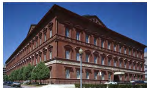
National Building Museum, Washington DC. Public domain image. Cropped

I sound a bit like an Old Testament prophet, it's because there is nothing about which I feel more strongly, more deeply, than the survival and the strengthening of the family. No civilization that neglects the family, can be called civilized for long, and no political philosophy that takes the family for granted, will be taken seriously by anyone who values morality, compassion and peace."