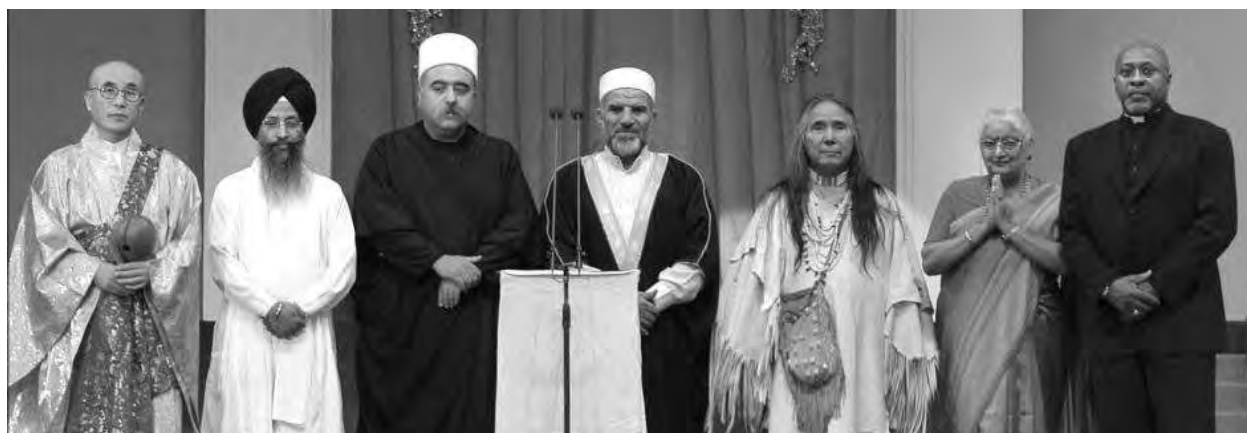
Religious leaders in Cheonan 13th July 2003

The event showed the scope of the activities in which FFWPU has been involved, including those that aim to overcome the problems caused by sexual promiscuity and crises of sexual identity, which are threatening to families, nations and, moreover, world peace."