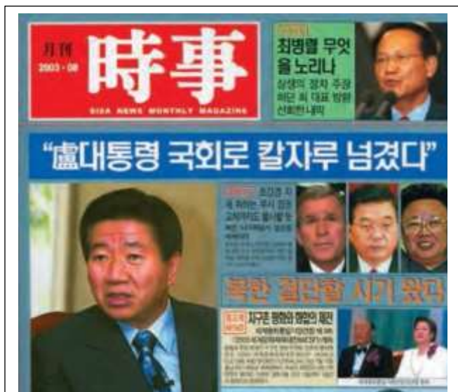
From the front page of August 2003 issue of Korean magazine Shisa News Monthly

We congratulate all the couples who took part in the 2003 Blessing ceremony 13th July 2003 in South Korea and other locations around the world, organised by the Family Federation (FFWPU). The main event was held in the large indoor arena Yu Gwan-sun gymnasium in Cheonan , a city of about 700 000 inhabitants, 85 km south of the capital Seoul. Father and Mother Moon officiated in Cheonan, where 3550 couples from many different countries participated, the majority from South Korea and Japan. Simultaneous events in different corners of the world were connected to the main ceremony in South Korea via satellite and internet, so that according to the organizers altogether 30,000 couples received the Blessing on their marriage.