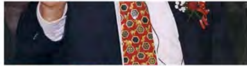
Sun Myung Moon 1st August 1996

'Religious organizations have always been centered upon the salvation of the individual, but we have now progressed to the salvation of the family. [...] Such an organization is not a church; it is the Family Federation for World Peace.'