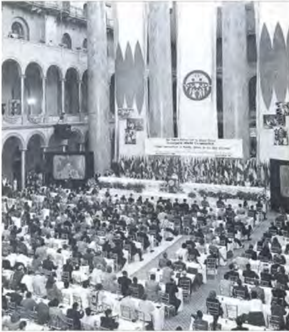
From the Inaugural Convention 31st July 1996.