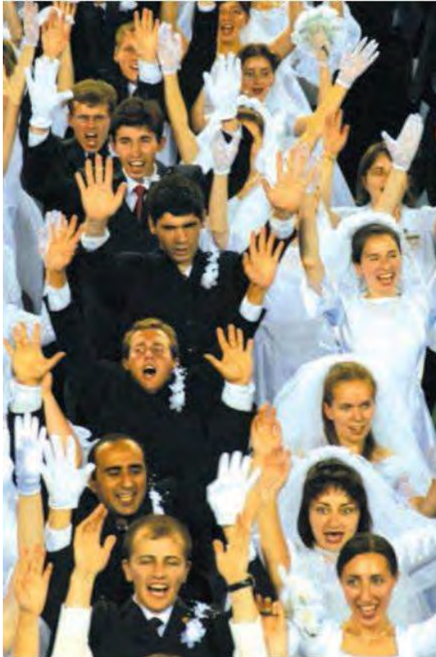
Some of the couples 13th July 2003 in Cheonan

[...] The family unit is the foundation upon which the modern society is built. Marriage is the beginning of the family unit. It is therefore important that marriage and marriages do not suffer from the defect of fetteredness of or the quirks of history.