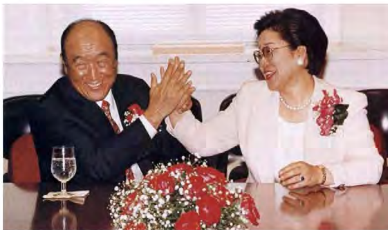
Father and Mother Moon 1st August 1996.

The Family Federation for World Peace and Unification is a global federation of individuals and families who aim to create a world of peace and unity beyond national, cultural, religious and ideological barriers, a world where everyone may live together in peace and harmony.