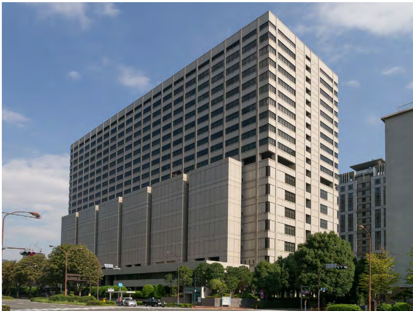
The building hosting the Tokyo District Court. Credits.

Article 4 of 4. Read article 1 , article 2 , and article 3 .