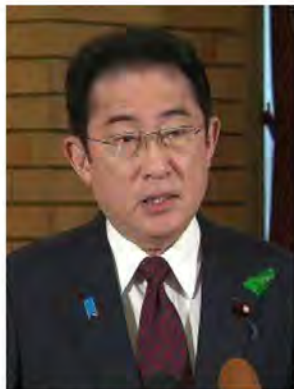
License: CC Attr 4.0 Int