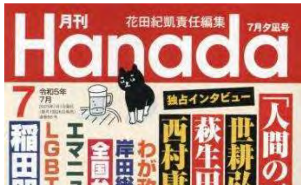
From front page of July 2023 issue of Hanada

Bitter Winter , an online magazine on religious freedom and human rights, published Fukuda's findings in a series of four articles in English. The first one appeared 23rd June, the fourth and last 27th June.